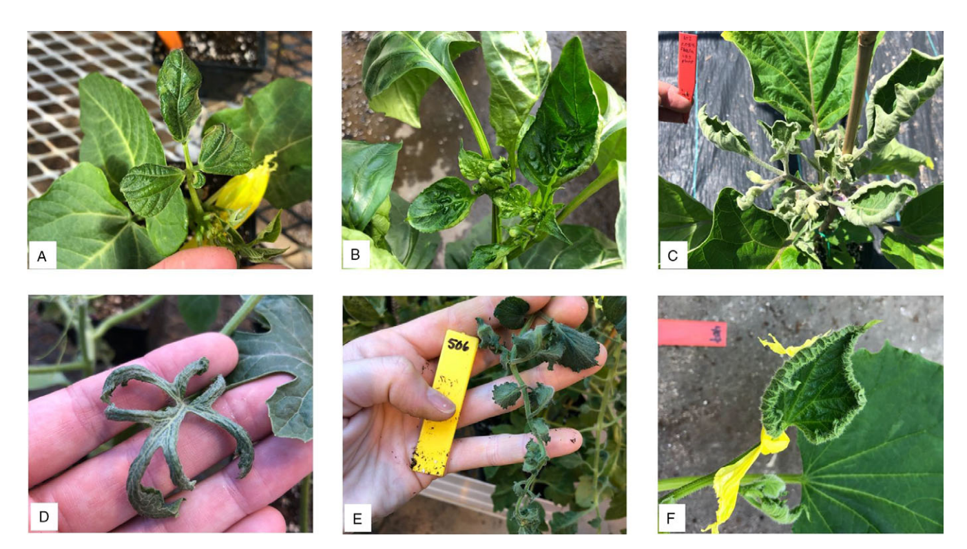
Figure 2. Pictures of the first emerged leaf for 'Fordhook Bush 242' Lima bean (A), 'Great Stuff Hybrid' bell pepper (B), 'Black Beauty' eggplant (C), 'Crimson Sweet' watermelon (D), 'Roma' tomato (E), and 'Burpless Beauty' cucumber (F) 28 d after application of dicamba at 2.24 g ae ha<sup>-1</sup>.

for soybean increased rapidly until it reached 2.00 g ae ha<sup>-1</sup>, where the curve approached a maximum near 55% visual deformation (Figure 1B). A meta-analysis of 11 soybean field studies by Kniss (2018) concluded that injury could be detected visually at rates as low as 1/20,000th of the label rate of dicamba (0.03 g ae ha<sup>-1</sup>). Additionally, a previous study showed that 1/400th of the label rate of dicamba (1.40 g ae ha<sup>-1</sup>) applied to snap bean resulted in 43% visual injury 18 d after treatment (DAT) as well as a significant yield reduction, further emphasizing the sensitivity of Fabaceae crops to low doses of dicamba (Colquhoun et al. 2014).