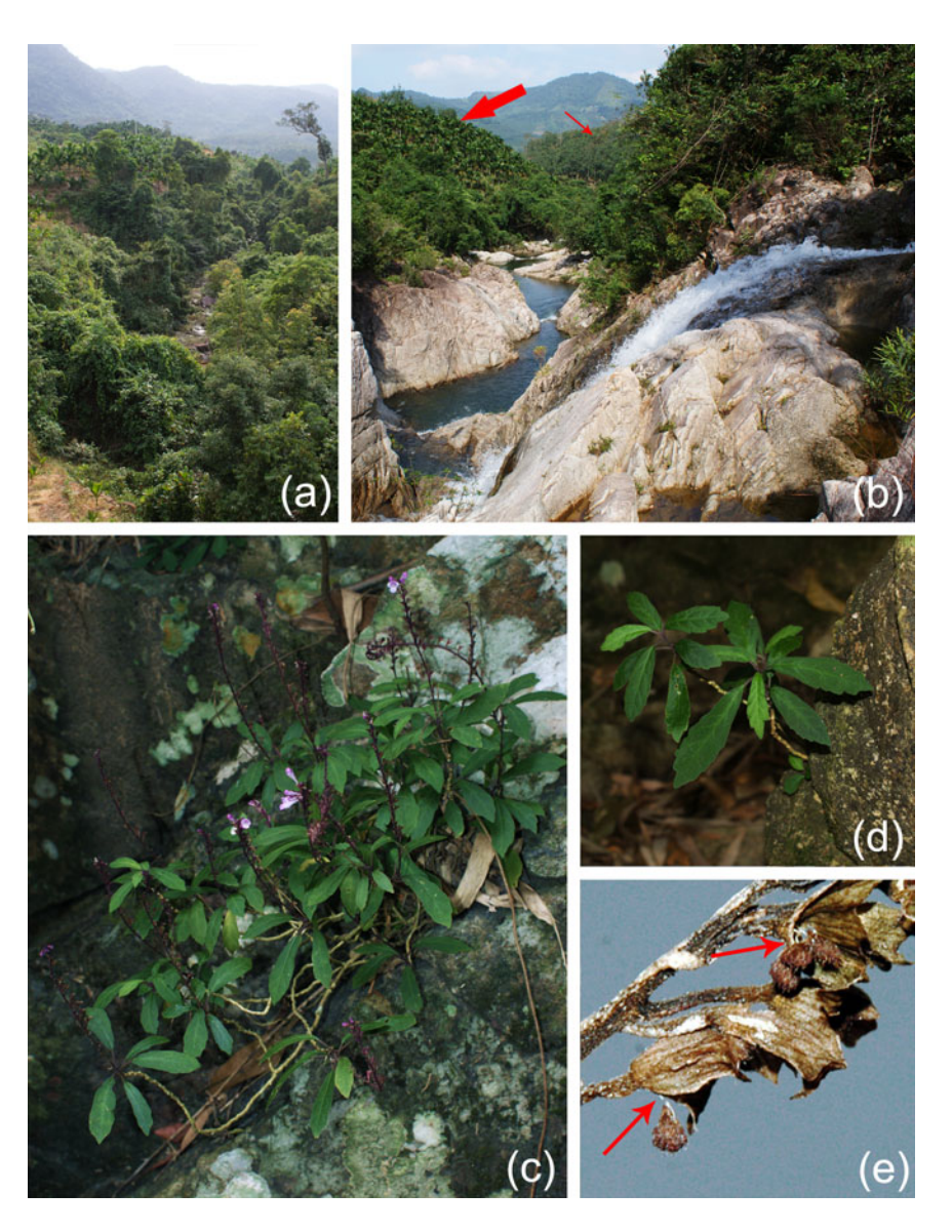
PLATE 1 (a) The rediscovered population of Wenchengia alternifolia in Shuangximu Valley, isolated among tropical crops, (b) the habitat (completely surrounded by areca plantations, arrowed), (c) a reproductive individual of W. alternifolia , (d) a nonreproductive individual growing in a moist stone crack, and (e) part of a dried infructescence with nutlets (arrowed) attached by flexible funicles.

Within this remnant population we counted 45 reproductive plants, 14 non-reproductive plants and seven seedlings (a total of 66 individuals). Reproductive plants mostly exhibit a clumped structure, each clump ('individual') consisting of 3–25 slender, leafy shoots (Plate 1c). Most of the shoots are prostrate or ascending, terminating in