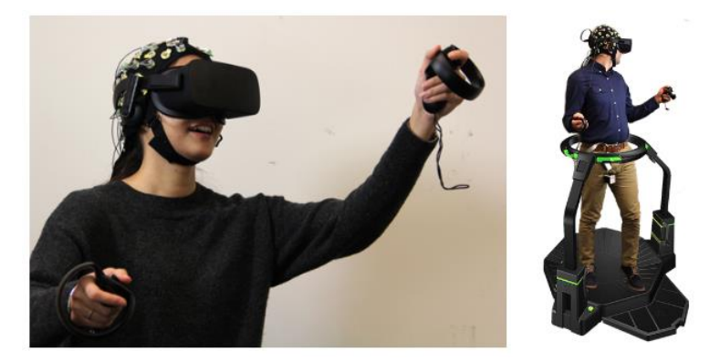
Figure 1. Off-the-shelf hardware is used in the MoBI research platform, including a VR headset, a treadmill, and an EEG cap.

share with ongoing development. To provide for an even greater immersive experience and more physical expression by the participants we also include in our system a treadmill device called the Virtuix Omni. This allows the users to "walk" through the virtual environment using physical leg motions, which can contribute tremendously to the user's sense of immersive experience (Figure 1). For research purposes, the use of the treadmill also allows us to record important data about the participants' responses to the environment, including gait speed and the length of pauses. Accelerometers are included to measure motions of the head and torso.