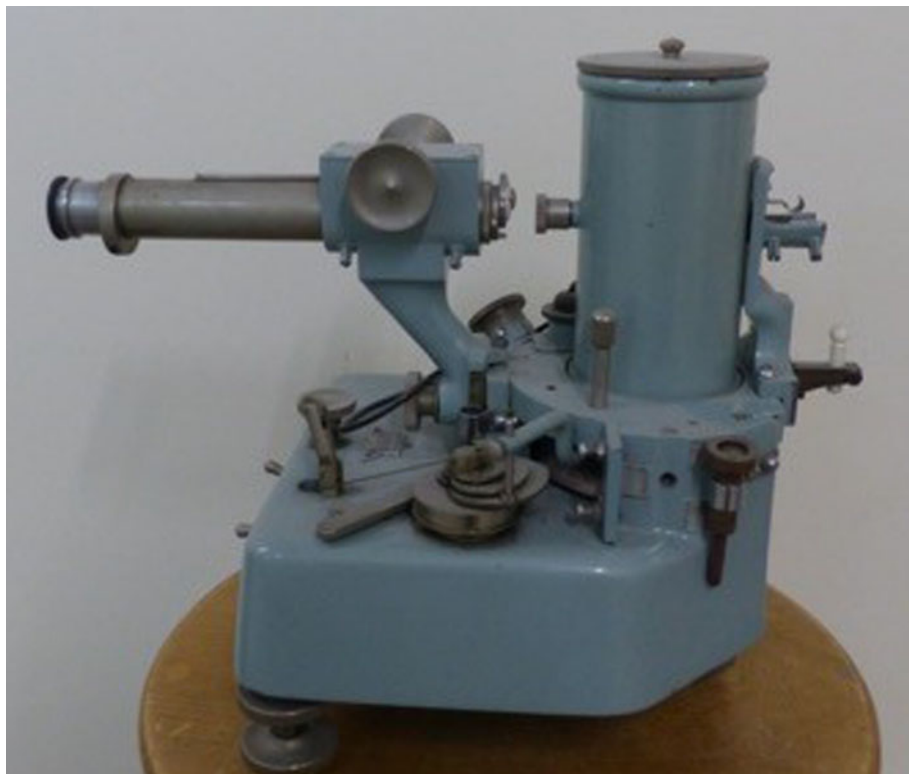
Fig. 2. A Unicam single crystal rotation and oscillation X-ray camera from the X-ray lab in the Department of Earth Sciences. It is an original instrument inherited from the Dept. of Mineralogy and Petrology. As well as being used by Mike for his research it was used for many years by students learning single crystal X-ray techniques.

single-crystal X-ray diffraction to characterise orientation relationships in crystals with exsolution textures. He must have been influenced by wider interest at the time in rocks from the Skaergaard intrusion, East Greenland, leading to another classic work based on the study of 50 crystals: “An X-ray study of exsolution phenomena in the Skaergaard pyroxenes” (Bown and Gay, 1960). Their work on pyroxenes and feldspars presaged a worldwide explosion of interest throughout the 1960s and 1970s in the microstructures of minerals, as observed and analysed using transmission electron microscopy, with another of Mike’s colleagues in the Department, Desmond McConnell, leading the way.