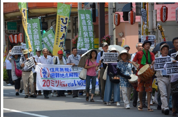
Hidanren march.