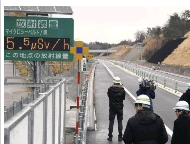
Area where some police officers and construction workers remain active on Route 6. The radiation level is 5.5 mSv. (2015). When I drove through the Tomioka-machi area near the Fukushima Daiichi this summer (2016), a bulletin board indicated 4.8 mSv.

Mutō: It is indeed propaganda. These things are actually happening in Fukushima and other affected regions.