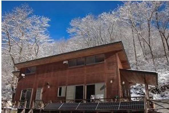
Kirara in winter