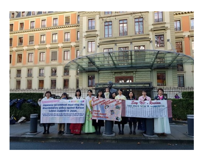
Figure 2: The members of omonikai visited the UN in Geneva to lobby at the 2019 CRC meeting in January 2019.

In order to protest against the successive cancelations of local government subsidies and to support the Chosen schools in their court cases against the government, a group of omonikai members visited the UN in Geneva in 2013, where the Committee on Economic, Social and Cultural Rights (CESCR) was holding its third periodic session on Japan.98 Along with other civil social organizations, such as the Japan Federation of Bar Association and Korean International Networks-MongDang Pencil, a South Korea-based civil rights organization that supports ethnic education in Chosen schools, the omonikai members informed the CESCR's committee of the violations of the human rights of children in Chosen schools. In its concluding observations, the 2013 CESCR indicated that the Japanese government had violated the Right to Education in Articles 13 and 14 of its treaty, again urging the government to extend the Tuition Waiver Program to Chosen high schools.99 Moreover, the 2014 CERD recommendation to the Japanese government pointed out that the government needed to "revise its position and allow Chosen schools to