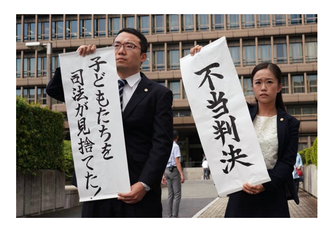
Figure 4: Members of the defense counsel in the Osaka case protest "Unjust Decision," in front of the Osaka High Court on September 27, 2018.

Convinced that they had no place in Japan to appeal these rulings, the support groups continued to raise awareness of the issue internationally. While the court decisions were handed down one after the other, the 2018 CERD's concluding observation in Japan revealed the discriminatory nature of the measures taken by the government in relation to the Tuition Waiver Program and urged the government to "ensure that students at Chosen schools have equal educational opportunities, without discrimination."107 Moreover, omonikai representatives visited the UN again in Geneva to lobby the 2019 CRC meeting, where they presented reference materials, data, and visual resources to inform the committee about historical and current discrimination and disadvantages suffered by Chosen schools and zainichi Korean children. Their efforts succeeded in attracting the keen interest of the committee, which concluded that the Japanese government needed to make fundamental changes regarding this issue. 108 The 2019 CRC report repeatedly recommended that the government "review the standards to facilitate the extension of the tuition waiver programme