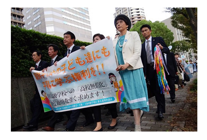
Figure 3: The plaintiff and supporters of Chōsen schools in the Osaka case marching to enter the Osaka High Court on September 27, 2018.

guarantee equality and the right of zainichi Koreans to develop their identity by learning their language, as well as by learning about their culture and history.