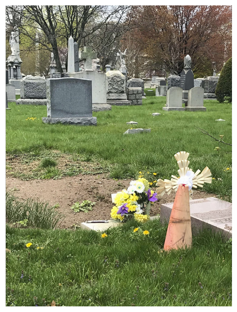
Figure 12. A grave without grass yet covering it with Palm Sunday cross Green-Wood Cemetery, April 23, 2021.

A riot of rot spreads across the cemetery. It morphs the landscape; Green-Wood—as a heritage site that moves between natural and artificial heritage, betwixt historical and contemporary frames, and in a liminal relational space of the living and the dead—is a fully living collection where each part co-configured the whole. It is, in effect, an entropic living site. Decay becomes substratum of life—decay rejects stasis and intact authenticity. Just as everything is living in Green-Wood, everything is also decaying; even the dead continue to decay. Death is not an end, as it were. In their FAQs one of the listed questions asks, "Why is there no grass at my loved one's grave?" (Figure 12). This is because it takes over a year for the grass to grow after the ground has been opened and the ground sinks causing headstones to move and plants not to take root. As a result, over those months of settling, the