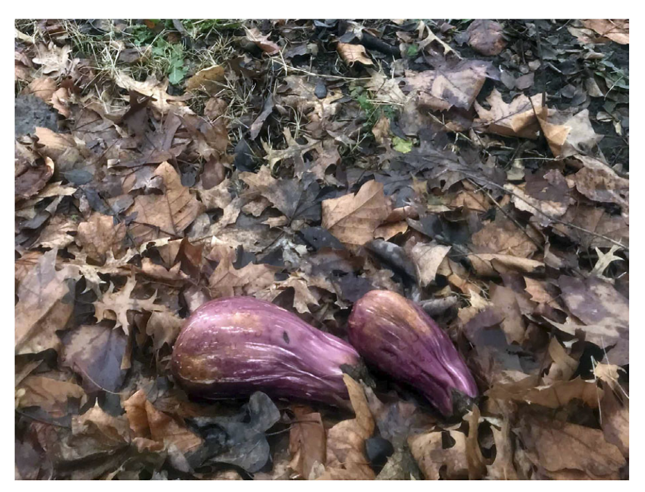
Figure 5. Eggplants at the Cemetery fence, March 1, 2021.