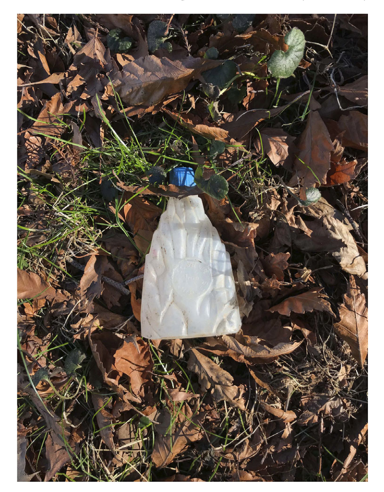
Figure 9. Souvenir from Lourdes. Green-Wood Cemetery, January 28, 2021.

and artificial forces. The material resistance to decay is seen in acts of amateur preservation, attempts to forestall the natural forces of rain, wind, and rot to keep photographs of the dead visible to the living. The prioritization of fresh flowers is rooted in a valuing of decay-able materials in an ecologically minded orientation, yet the promise of removal once the decay is visible continues to situate decay itself as undesirable.