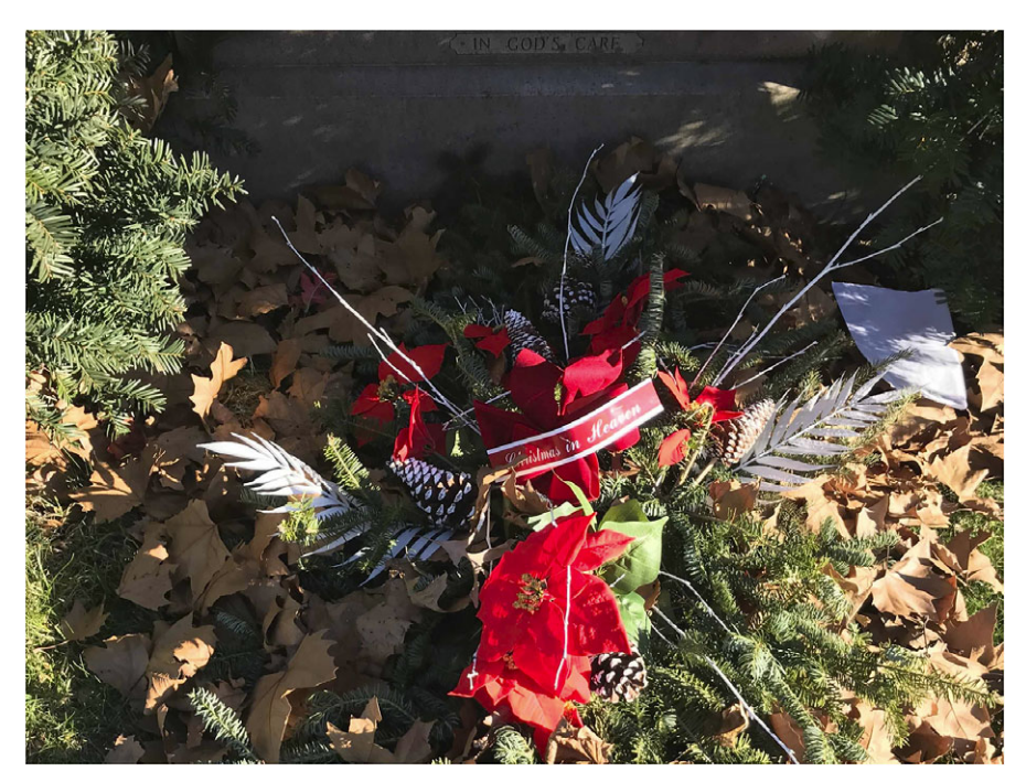
Figure 4. "Christmas in Heaven" bouquet on a grave, January 10, 2021 at Green-Wood Cemetery.

Green-Wood, eggplants were resting and slowing rotting on the leaves by the fence at the edge of the cemetery (Figure 5). The eggplants place us in the larger neighborhood context that Green-Wood cemetery now is located in; no longer a rural cemetery, it has been a fixed point within a changing Brooklyn. Today, the cemetery is located a few blocks from Flatbush which, in 2018, was named "Little Haiti" a year after Flatbush also received the cultural district designation "Little Caribbean." Eggplants are common cemetery offerings within Afro-Caribbean traditions and are specifically connected to Orisha Oya who is connected to cemetery gates and the color purple, as Saille Caia Murray notes in her analysis of food offerings in the Sugar Hill area of Harlem. Consumption in the cemetery engages in symbolic, spiritual, and accidental relationships mediated by the actors in the cemetery—the dead and the living human and non-human animals. At a graveside in early January, I watched as a young man drank half a bottle of Dewar's White Label before he capped the bottle and propped it up on the tombstone before leaving (Figure 6).