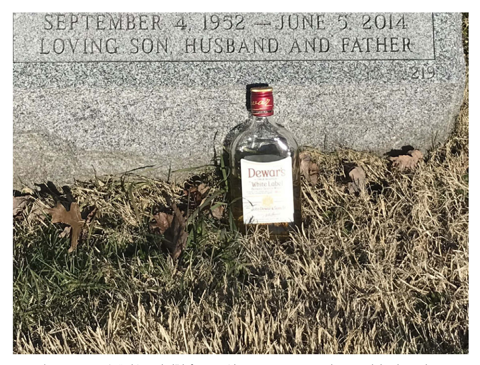
Figure 6. Dewar's "White Label" left graveside January 10, 2021.