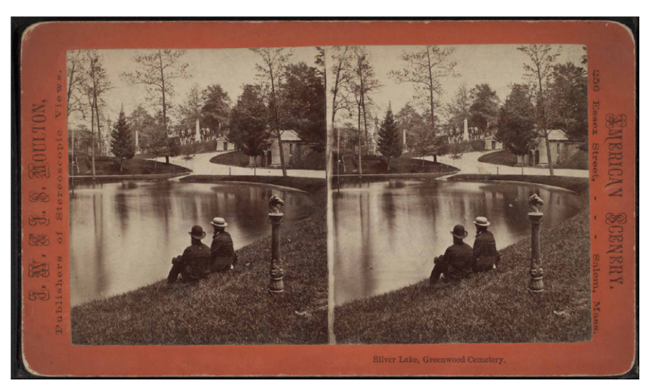
Figure 1. The Miriam and Ira D. Wallach Division of Art, Prints and Photographs: Photography Collection, The New York Public Library. "Silver Lake, Greenwood Cemetery." New York Public Library Digital Collections. Accessed October 18, 2023. https://digitalcollections.nvpl.org/items/510d47e1-e682-a3d9-e040-e00a18064a99

New York Times article, from thirty years after the cemetery's founding, presents it as an idyllic rural space and one in sharp contrast to the inherited conceptualizations of what burial sites were; the author writes, "Green-Wood does not realize the old-fashioned grim memoires of the church-yard where ghosts and goblins were wont to hold high revel. People in their first paroxysm of grief would prefer to wander through groves of weeping willows, but not too many. The Comptroller ... very properly remarks, 'however pleasant the shade, the sunshine is better. There is nothing so neat and clean—nothing that is so pleasing at all seasons and to all eyes, as close shaven green sward." 5