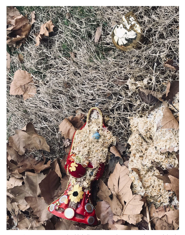
Figure 11. Decaying Santa Muerte and gold skull, Green-Wood Cemetery.

The paradox of still life is using a static moment to unfurl the longer durational timeline of decay and mortality. The decay-life of things is a paradox of living after death. Decay is active; the fungi, water, insects, rats, and groundskeepers act as a network of actors facilitating, arresting, and ending decay. The tributes, as a point of contact between the hemispheric pairing of the living and the dead decay for us visibly in the cemetery. They entangle the dead and the living in the processes of decaying as part of a wet entropy of rot. Bodies and leaves rot in the park, the cut flowers turn to brown sludge attracting mosquitos, and the grass grows back covering the overturned dirt of new burials. The decaying Santa Muerte statue (Figure 11) rotted in the corner of the cemetery; next to it, a gold skull like a shinning bauble remained whole and eventually was picked up and placed upright on the cement ledge supporting the fence posts until it too vanished. Taken, thrown out, tarnished, tattered—somewhere the dead were left a tribute that ended up thrown against the fencing that kept it contained within the deathscape of the cemetery.