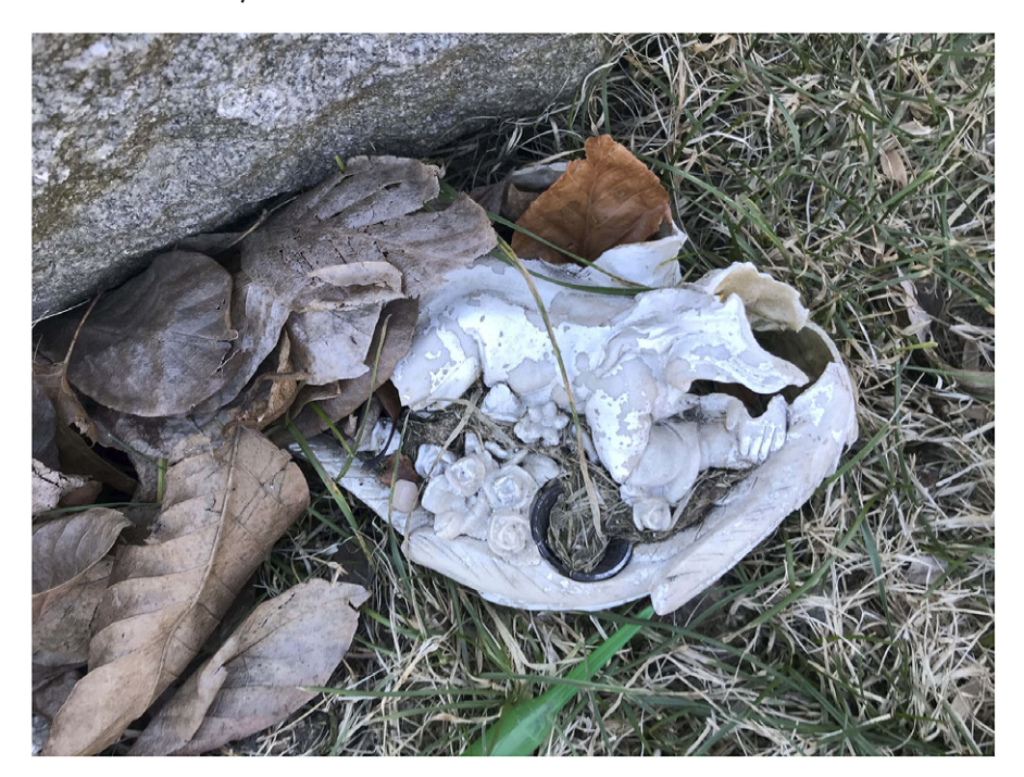
Figure 8. Broken statue. Green-Wood Cemetery, February 16 2021.

the trash remnants hold in the experience of space. A techno-utopian fantasy of preservation is an arresting of decay. The ecology of decay and its facilitation of entropic materiality becomes a politics of the Anthropocene where the permeability of things is imperative to combat stockpiling of capital that threatens to overwhelm us in museums and trash heaps. <sup>28</sup> The TRES art collective (Ilana Boltvinik and Rodrigo Viñas) work with trash materials in their art practice and attend to the pervasiveness of waste in local and global contexts. In these spaces, however, they are interested in "the intimate relationships we have with waste" where the closeness in which "we live with waste becomes an aesthetic experience that reveals new information and symbolic values about trash and our society." TRES works with trash as a local and global category, one that moves between hyper-embedded local experiences and a global crisis.