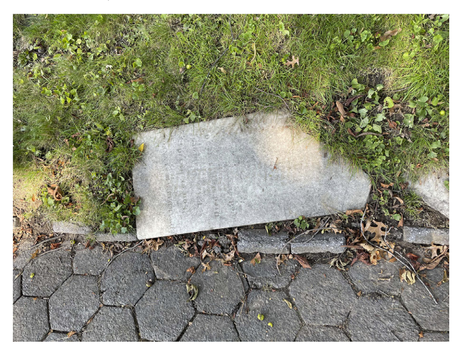
Figure 10. A grave marker partially submerged at the bottom of a hill. Green-Wood Cemetery, January 10, 2021.

next to the paved pathway, most likely separated from the place it marked out for bodily decay (Figure 10). Decay as a universal condition of materiality entangles the living and the dead within a temporality of rot and ruin.