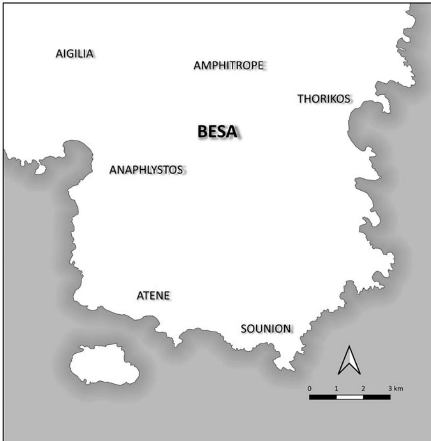
FIG. 1. Map of south Attica showing the location of Besa.

the early third century C.E. were enrolled as citizens of Besa. How and why did this deme come to be so important in the Roman Imperial period, and why did it harbour a disproportionately large number of important Roman citizens given its small area and population? In this article, we shed light on the imperial and elite Roman presence at Besa, with a particular focus on its most illustrious citizen, Emperor Hadrian (r. 117–138 C.E.).