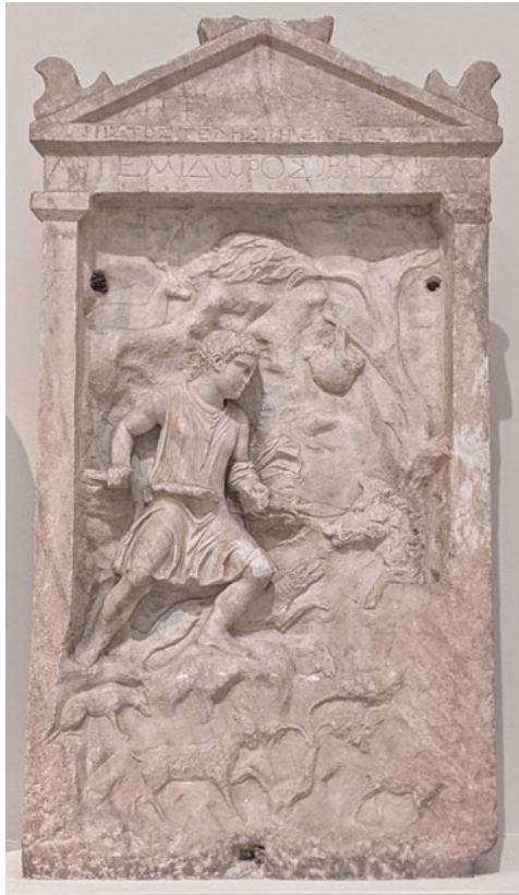
FIG. 3. Grave stele of Artemidoros of Besa hunting a wild boar, Hellenic National Archaeological Museum. Inv. Nr. NAM Γ 1192.

found at Thespieae in Boeotia reveals that he had killed a bear and dedicated its skin to the local god, Eros. 36 Although at least one scholar has attempted to trace the origin of that bear skin to one of his hunts in Mysia, where he is recorded to have killed a bear from horseback and the location of the imperial hunt henceforth took the name of Hadrianoutherai ('Hadrian's hunts'), 37 in our view, it is more plausible that the bear was killed either in Boeotia or in Attica. What better place to indulge his passion for hunting than his home deme of Besa, which afforded ample hunting territory that could be traversed on horse and/or foot?