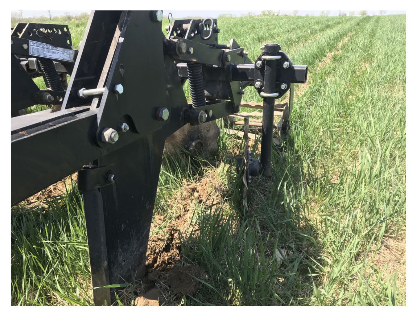
Fig. 2. Strip-tillage treatment being applied using Unverferth Zone Builder Subsoiler Model 122.

stand density, and likely intraspecific competition, appears to have allowed the remaining Kernza plants to grow more vigorously and produce more seedheads per unit area given enough time between disturbance and harvest. Strip-tillage treatments did not affect spikelet and floret counts per seedhead at harvest, however, indicating that differences in seed production were not driven by differences in inflorescence size that have been reported in other perennial grasses (Abel et al., 2017). Even strip-tillage in the spring reduced competition between reproductive tillers as there was no difference in yield despite lower stand density compared to the control. Similar effects on seedhead density were reported in previous work using stand thinning to stimulate seed production of other perennial cool-season grasses. In a study using Kentucky bluegrass (Poa pratensis L.), Evans (1980) found edge effects affecting panicle density, with higher panicle density closer to areas where sections of row had been removed after seed harvest and lower density in areas further from disturbance, suggesting competition for light and space decreased floral induction. The disturbance caused by strip-tillage is likely to have altered some environmental conditions, including light quality, that influence floral induction, but other factors such as photoperiod and temperature are more seasonally dependent (Kalton et al., 1996). Stand-thinning via strip-tillage after harvest could also