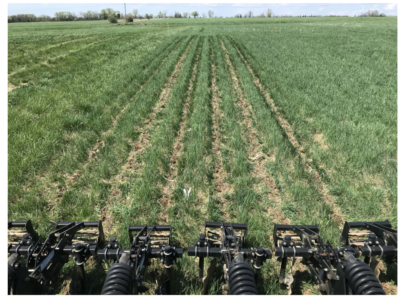
Fig. 3. Soil disturbance after strip-tillage with Unverferth Zone Builder Subsoiler Model 122.

development during regrowth after harvest, followed by reproductive tiller induction during overwintering, and floral development the following spring (Majerus, 1988; Heide, 1994; Cattani and Asselin, 2018). Disturbance at later stages of this process would therefore have greater potential to reduce fertile tiller density as there would be less opportunity for reproductive tiller replacement even if resources were otherwise abundant. Some perennial grasses are able to produce new reproductive tillers in the spring after vernalization, but these tillers tend to be smaller and produce fewer seeds and disturbance after this secondary induction would only stimulate regrowth of vegetative tillers (Abel et al., 2017). Moreover, any tillers that are newly established in the spring may compete for resources with larger tillers produced the previous fall, potentially reducing seed yield via reduced inflorescence size or reduced seed set (Aamlid et al., 1997). It is also plausible, however, that disturbance during spring in our experiment, which did not negatively impact grain yields relative to the control, might have a positive effect on yield at the second harvest after treatment.