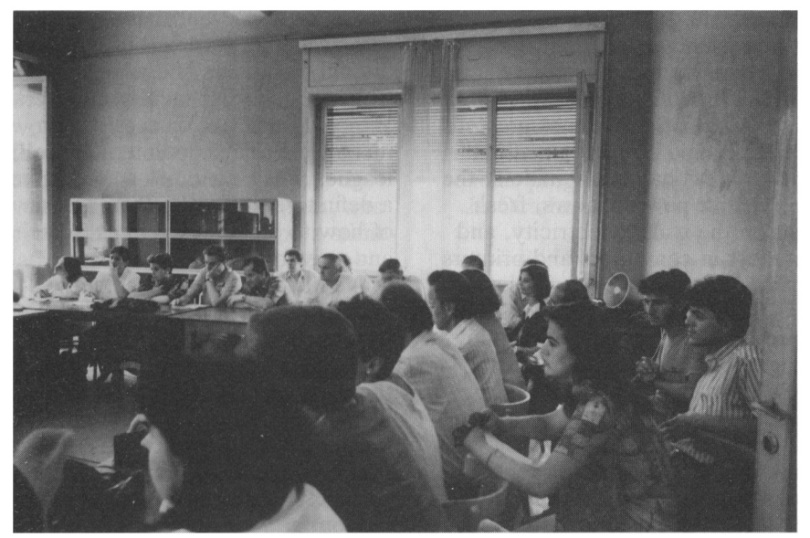
An important aspect of both visits was the public roundtables, which were attended by over 100 people within and outside the university.

Albania. We did our best to couch our discussions in these terms.