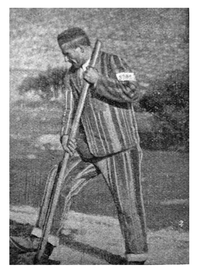
Figure 2. A prisoner working in the Castiadas agricultural penal colony at the beginning of the twentieth century.

Giuseppe Cusmano, "Castiadas: casa penale agricola", Annuario Agricolo Illustrato, 1903, p. 109.