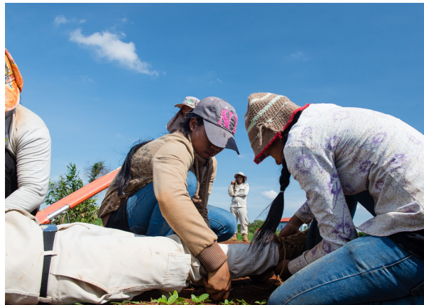
Ban Lung, Ratanakiri Province, Cambodia, 2014 - An NPA deminer supervises a group of new recruits performing a first aid drill in the field behind the NPA compound.

for Ratanakiri Province in the northeast part of the country, 580 km northeast of Phnom Penh – a nine and a half hour drive in 2014 over atrocious roads. (Actually, the teams had three male employees: a driver, a medic, and the computer data specialist.)