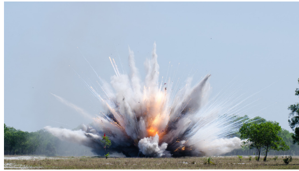
Quang Tri Province, Vietnam, 2013 - A controlled demolition conducted by an EOD team from Project RENEW.