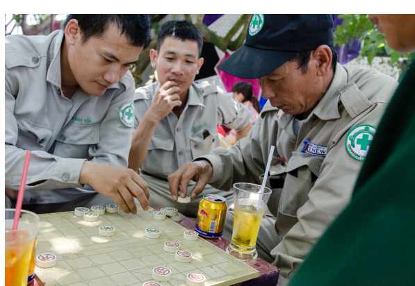
Thua Thien Hue Province, Vietnam, 2014 - After completing the day's ordnance destruction, they go for nonalcoholic drinks at a local café and play checkers.