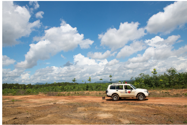
Quang Tri Province, Vietnam, 2013 - One of Project RENEW's ambulances. All field teams of Project RENEW and NPA are accompanied by a medic and an ambulance.