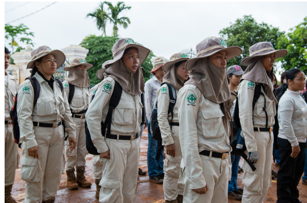
Ban Lung, Ratanakiri Province, Cambodia, 2014 - Early in the morning, the two NPA all-female EOD and survey teams deployed in Ratanakiri Province in Northeast Cambodia line up at the NPA compound for the day's briefing before being driven to their mission.