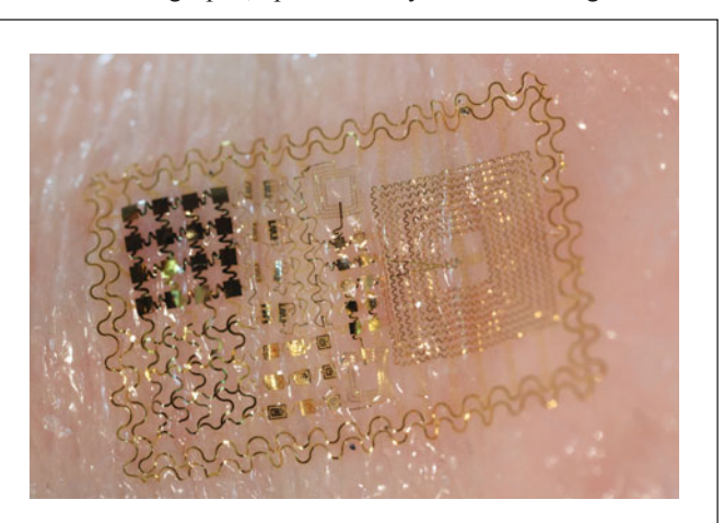
The electronics are mounted directly to the skin, with no need for wires, conductive gel, or pins. They bend, stretch, and deform with the same mechanical properties of skin, granting the wearer comfort and freedom of movement.