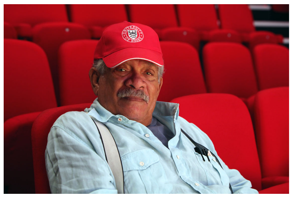
Figure 5. Derek Walcott at rehearsals of Pantomime, University of Essex, 2012.