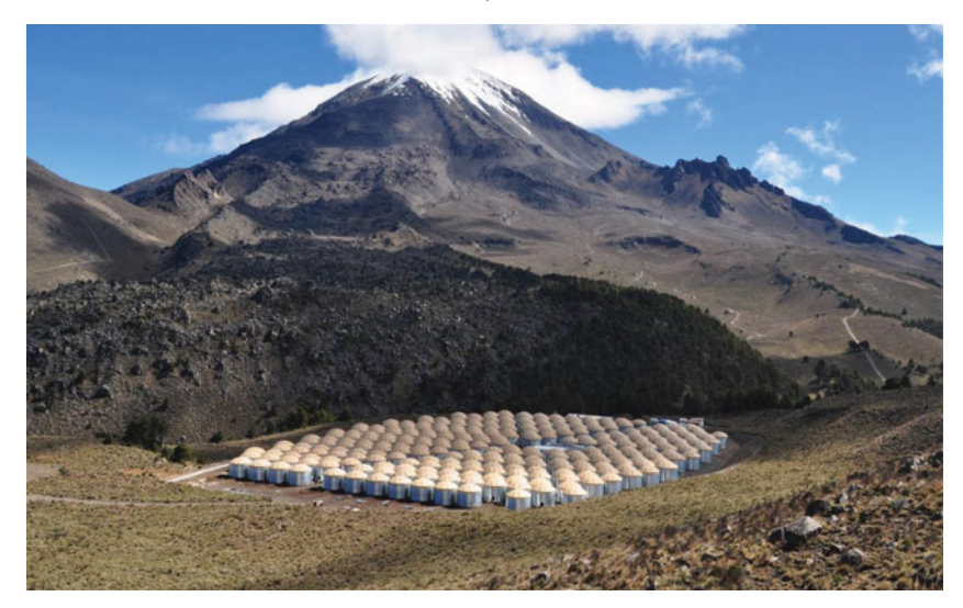
Figure 1. A photo of the HAWC Observatory, taken in September 2014, with more than 250 tanks built.

array of individual WCDs, housed in tanks as seen in Fig. 1. This modular design made it possible to start preliminary data-taking with 30 WCDs in the fall 2012 and scientific operation with 111 WCDs in August 2013. While data taking and construction continues, sets of new WCDs will be added over the following months. The start of operations with the full array of 300 WCDs is projected for early 2015.