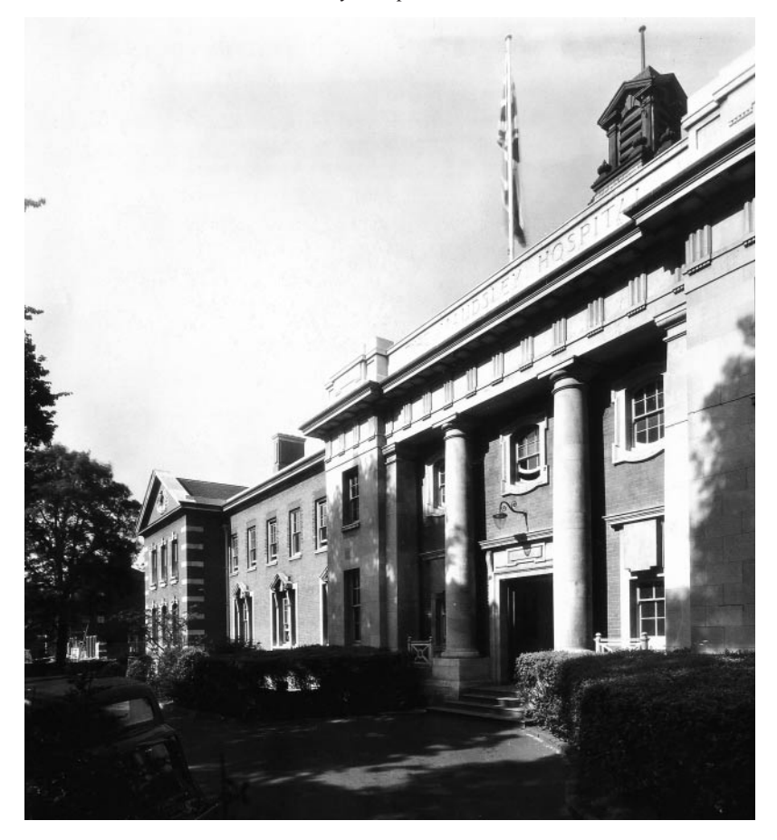
Figure 2 : The main entrance to the Maudsley Hospital, photographed in May 1935. The buildings were designed by the LCC's mental hospitals engineer, William C Clifford Smith, FRIBA (London Metropolitan Archives).

asylums" and that "great gain would accrue from the acquisition of knowledge in regard to the causes of insanity and its prevention".<sup>25</sup>