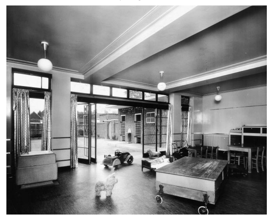
Figure 4 : The playroom for the children's outpatients department, photographed in 1939.

paratyphoid, and dysentery" from spreading in asylums. He also advocated investigation of the endocrine system, which served as "the foundation of the nervous condition of the body".<sup>85</sup> This strategy had the welcome side-effect of drawing psychiatry within the ambit of general medicine and, if successful, would have raised the status of its practitioners. "The value of this steady scientific research into the physical disorders underlying mental illness", Mott concluded, "is unquestioned".<sup>86</sup> The focal sepsis hypothesis was pursued with enthusiasm by some medical superintendents, notably Thomas Graves at Rubery Hill and Hollymoor mental hospitals, where he encouraged patients to undergo surgical procedures to remove teeth, sinuses and tonsils, while other anti-infective initiatives included vaccinations, continuous colonic lavage and ultra-violet light treatment.<sup>87</sup>