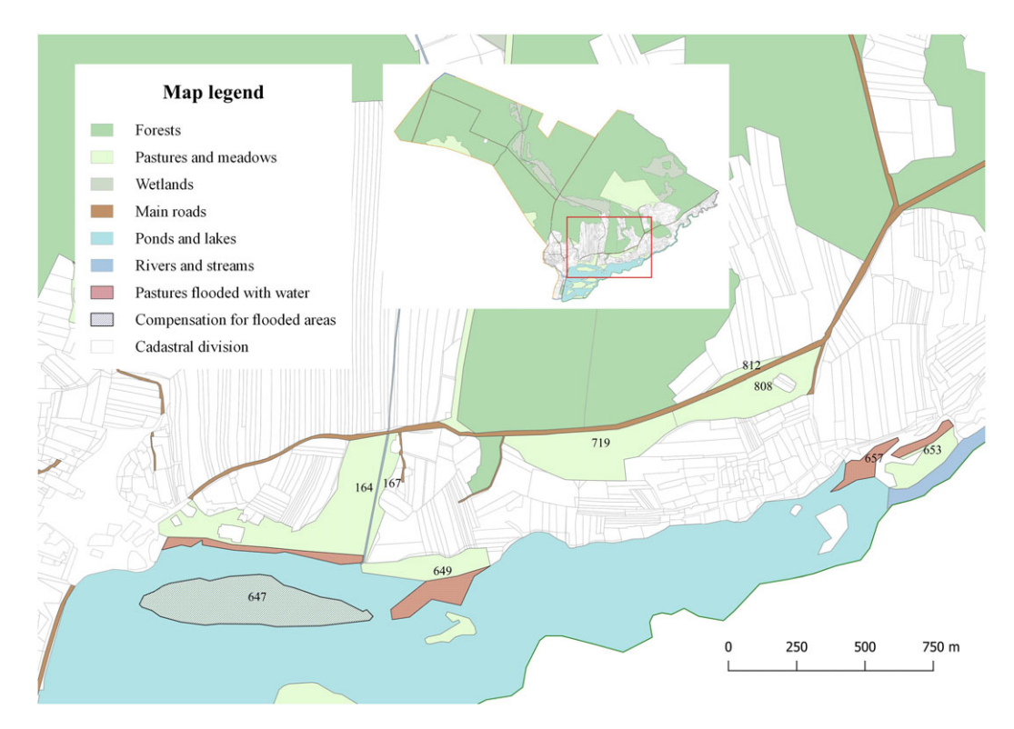
Figure 3. Peasants' flooded pastures in Nowa Grobla, alongside compensation received, in 1864. Created by the author in QGIS 3.4.4.

relations, especially between the court and the previously subordinated population. The proceeding abolition of rights in the second half of the nineteenth century, combined with the division of common land, was not accompanied by other desirable agrarian reforms, such as ending the so-called chessboard: the massively extensive fragmentation of land. The 'reparcelling' of farmland did not take place until the end of the nineteenth century and did not produce measurable results until the outbreak of the First World War.<sup>68</sup>