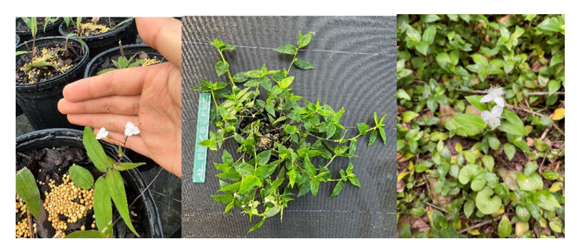
Figure 1. The flower (left) and whole plant (middle) of Gibasis pellucida compared with Tradescantia fluminensis (right).

<sup>b</sup>Herbicides were applied with the addition of a non-ionic surfactant (AirCover, Winfield Solutions, St Paul, MN, USA) at a 0.5% v/v rate based on the manufacturers' recommendations.