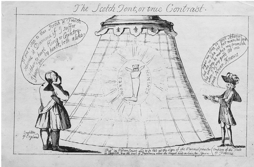
Figure 10.2 Mary Darly (publisher), The Scotch Tent, or True Contrast , 1762. Etching on laid paper, 19.2 × 29.2 cm.

the attacks on Hogarth included at least three prints: Tit for Tat , described above; The Scotch Tent 24 (Figure 10.2) which was lettered in Mary's hand, 'Pubd in Ryders Court and to be had at the sign of the Pannel painter in Cheapside [the print shop of John Smith where the sign was Hogarth's head], or at the bust of Impudence alias the brazen head in Leicester Square [Hogarth's home]'; and The Boot & the Block-Head , 25 where Buté's boot is suspended from Hogarth's 'Line of Beauty'. It is interesting to note that Hogarth's house was only about 300 yards from Ryder's Court, and that Princess Augusta lived even closer at Leicester House. Mary's market for these prints would have been the courtiers and politicians who visited both houses.