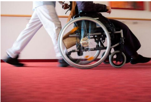
Figure 3. The third most used photograph in the sample.