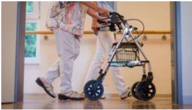
Figure 2. The second most used photograph in the sample.