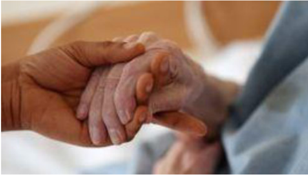
Figure 1. The most used photograph in the sample.