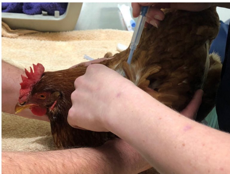
Figure 2. Ruby getting a Suprelorin implant inserted into her back.

We returned with our remaining chickens to the veterinarian to have them implanted with the Suprelorin contraception (Figure 2). Suprelorin contains the active ingredient deslorelin and is used in male dogs and ferrets to produce temporary, reversible infertility (European Medicines Agency 2012). In female dogs, Suprelorin stimulates oestrus and ovulation, and is used by the dog breeding industry on females who