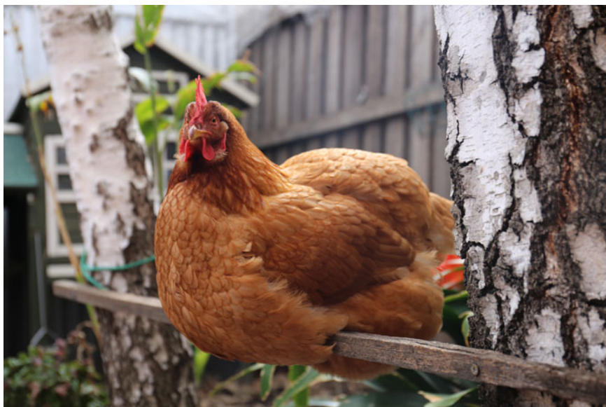
Figure 1. Sultam, the flock leader, looks on. At this point in mid-2017, she had already been implanted for a year © Yamini Narayanan).

The paper is structured as follows: the next section articulates a theoretical framework of ability , bringing together feminist CDS and feminist animal studies. It then provides an overview of the rationale of selective breeding of chickens to have hyper-ovulating reproductive systems to serve the egg industry. Thereafter, the paper develops an empirical section that details the reproductive issues faced by our rescued hens, and our decision to place them on contraception (Figure 1). Last, the paper examines and complicates chicken contraception as a “cure” to such patriarchal control and commodification of female reproduction.