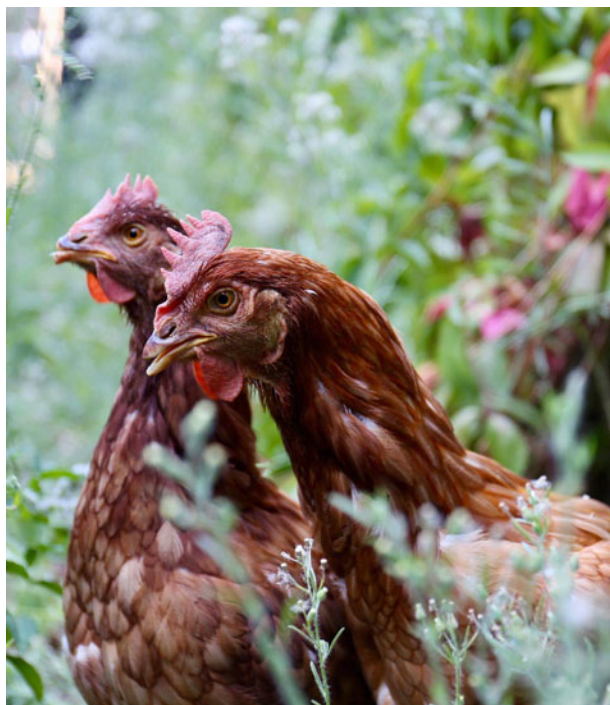
Figure 3. Ex-battery hens Popper and Charlie discovering a world of freedom with amazement and wonder.

contraception. In the women's movement, contraception was central in shifting the axis of power and control in the fraught history between feminists and the state over reproductive rights (Bracke 2017). So too, chicken contraception might allow humans to imagine the cessation of selective breeding of the egg commodity .