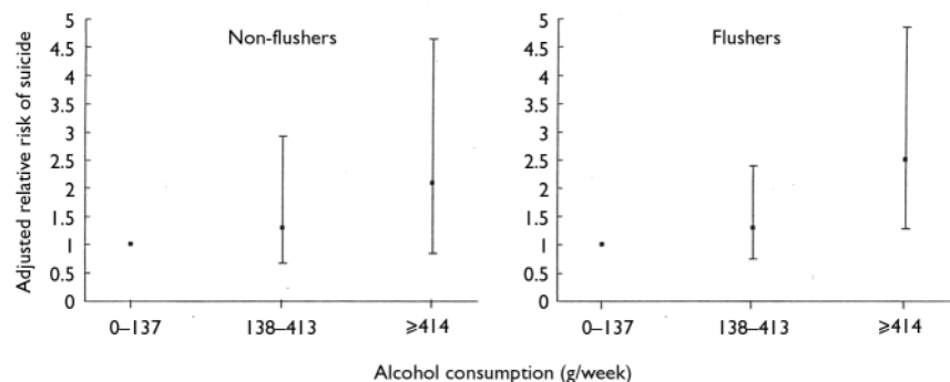
Fig. 2 Relative risk of suicide after adjustment for age, area, living alone and employment status according to alcohol consumption in flushers and non-flushers. Bars represent 95% confidence intervals.