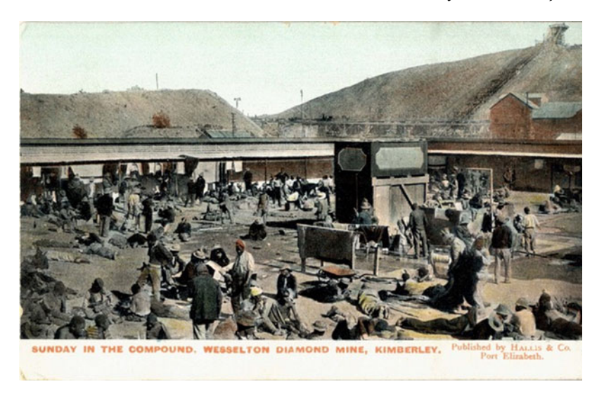
Figure 2. Postcard showing the compound of the Wesselton diamond mine in Kimberley, date unknown.

compounds (Figure 2).<sup>110</sup> She offers a brief discussion of the architecture, the salaries of the white managers and guards, the recruitment process, and the practice of the mining companies to set up stores inside the compounds. The argument that this took a profitable business away from Kimberley's merchants was the only protest uttered in the white community of Kimberley against the compounds.<sup>111</sup>