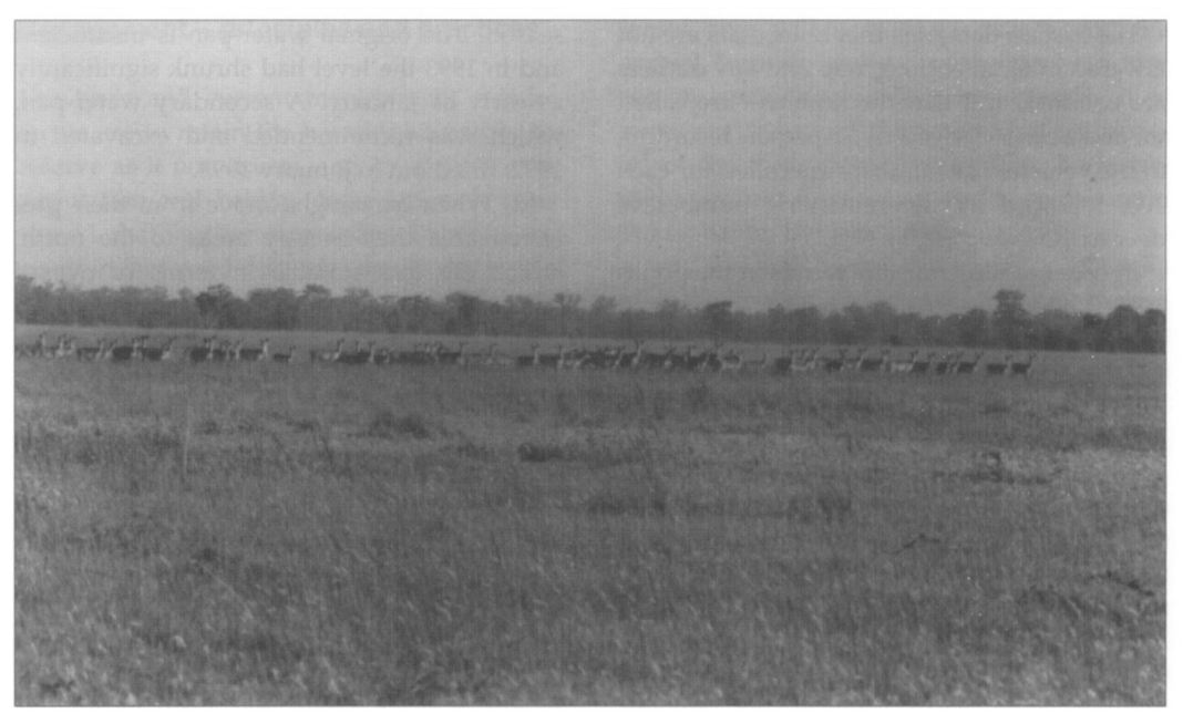
The behaviour and habitat of the barasingha together offer a rare opportunity to census the entire population.

are often less convincing with reference to brain logic than computer-derived statistical tests imply. However, the barasingha population in Suklaphanta can be counted in its entirety when the deer congregate in the recently burned main Suklaphanta and when none can be found anywhere else.