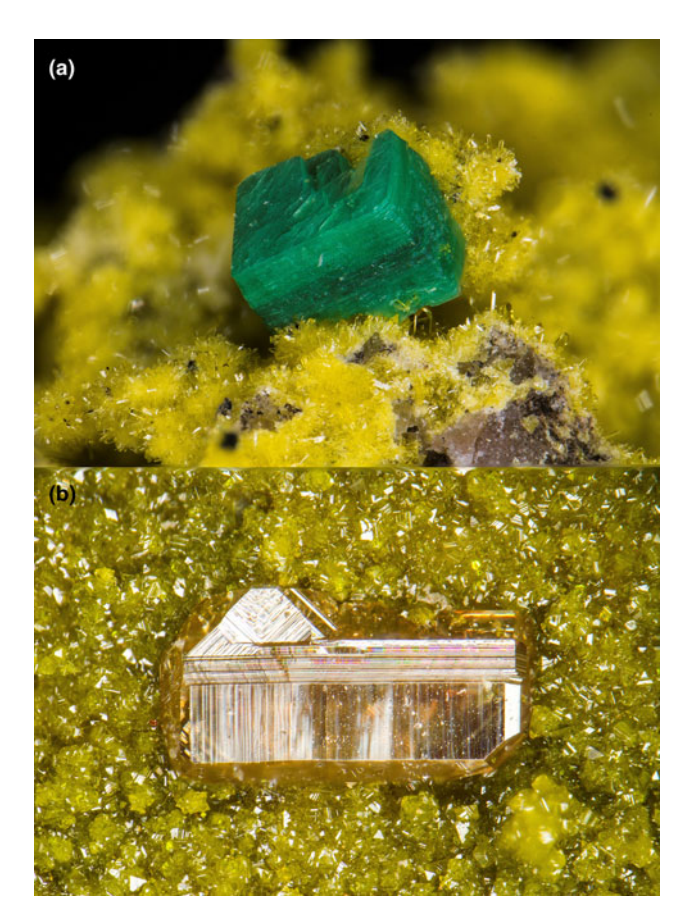
Fig. 1. (a) Torbernite on kasolite from Shinkolobwe, DRC; (b) chervetite on francevillite from Mounana mine, Gabon. Field of view \sim 2.5 mm across. Collection Valérie Galea-Clolus.

Uranium minerals are particularly amenable to geological dating from very small samples, as the predominant isotope 238U is a major constituent of the total U content (97.3 at.%) and radioactive with a half-life comparable to the age of the Earth. Today, uranium occurs in multiple valence states: as relatively immobile U4+ in a small number of very insoluble primary minerals, such as uraninite (ideally UO<sub>2</sub>); as U<sup>6+</sup> in a much larger number of species containing the relatively mobile, soluble uranyl cation [UO<sub>2</sub>]<sup>2+</sup>, such as torbernite and francevillite (Fig. 1); and rarely as the intermediate U<sup>5+</sup> in minerals such as wyartite. The enhanced mobility and ability to form a wide range of mineral structures leads to the great diversity of U<sup>6+</sup> minerals under nearsurface conditions (Burns et al., 1997; Lussier et al., 2016). Thus, uranium mineral diversity has evolved markedly through geological time (Hazen et al., 2009), from the anoxic conditions of the Archaean, dominated by primary and detrital deposits of U<sup>4+</sup> minerals, through to the present day, when such deposits