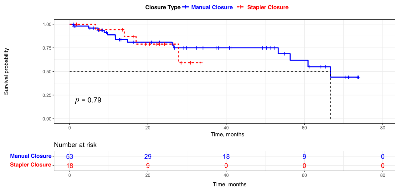
Figure 2. Kaplan-Meier plots comparing stapler closure and manual closure groups.

23.4 per cent) was noted for stapler closure in a recent meta-analysis by Chiesa-Estomba et al. 17 Similar results were found in our study where pharyngo-cutaneous salivary fistula was noted in nine (16.98 per cent) of the 53 patients who underwent manual suturing and two (11.1 per cent) among the 18 patients with stapler closure. Various techniques have been adopted to decrease the incidence of pharyngo-cutaneous salivary fistula, such as tension-free manual closure techniques (namely T-shaped closure) or vertical closure and overlaying of a pedicled or a free flap.