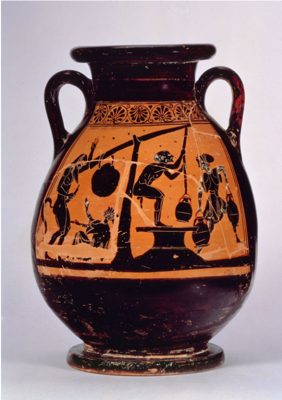
Fig. 3. Black figure pelike with old man, satyr and women fetching water from a cistern or well, ca. 525–475. Berlin Staatliche Museen, Antikensammlung, 3228.

fountain-house scenes). His metic status, and poverty, is important here, of course, and these activities are not presented by Diogenes Laertius as in any way honourable. 105 In comparison, the water-carrying role of women is ritualized in various religious contexts, for example the participation of (female) hudrophoroi in processions at Demeter sanctuaries across the Greek world. 106