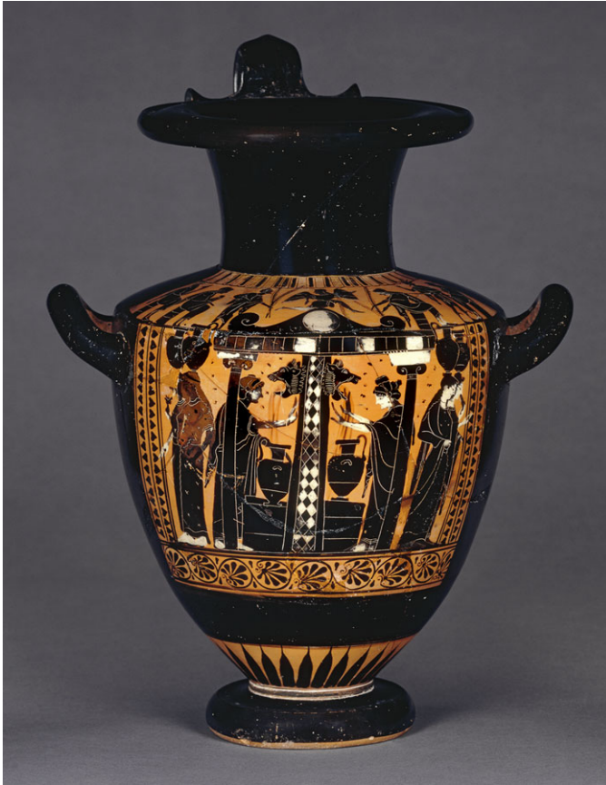
Fig. 2. Black figure hydria with women at the fountain house, ca. 520–500, Vulci. British Museum BM334.

That fetching water was gendered as women's work is also clear from the iconographic evidence, particularly scenes of women at the fountain house, popular on Athenian pottery in the late Archaic and early Classical periods. Men appear sometimes in these scenes (see below), but they are vastly outnumbered by women (see, for example, fig. 2). However, in concentrating on how these images construct idealized and idealizing notions of gender, scholars have missed the opportunity to consider how these discourses shaped lived experience. 100 Such readings deliberately set themselves apart from quotidian concerns; the depictions here are cultural constructs, not actual women whose bodies were transformed by