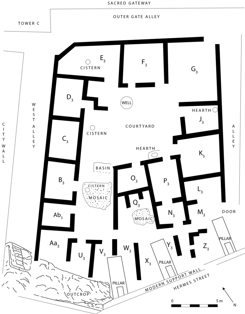
Fig. 1. Plan of Bau Z3, Kerameikos. Drawing by Thanasi Papapostolou based on Knigge (2005) supplement 5 and Ault (2016) fig. 4.4.

under her spell. The depiction of the activities that took place in the building, for example, Euktemon dining with Alke (6.21), its location near the postern gate (6.20) and the mention of oikēmata where Alke allegedly worked, albeit not here but in a building Euktemon had previously owned in the Piraeus (6.19), were linked to the archaeological finds of Bau Z and used as a template for interpreting them. The small personal items of jewellery and religious figurines were seen therefore as the property of foreign slaves (the paidiskai of Euktemon's Piraeus sunioikia , 6.19), the coins were evidence for the selling of sex and the