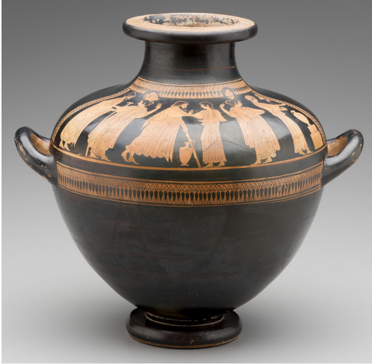
Fig. 4. Red Figure pelike attributed to the Pig Painter, ca. 475–450, depicting mantle-wearing men accosting women at fountain. Detroit Institute of Arts, Founders Society Purchase, General Membership Fund, 63.13.

seen as marginal. In fact, it overlapped with other activities: food preparation, cleaning, animal husbandry, the watering of plants, pottery manufacture, metallurgy, etc. No activity was possible for long without a supply of water.