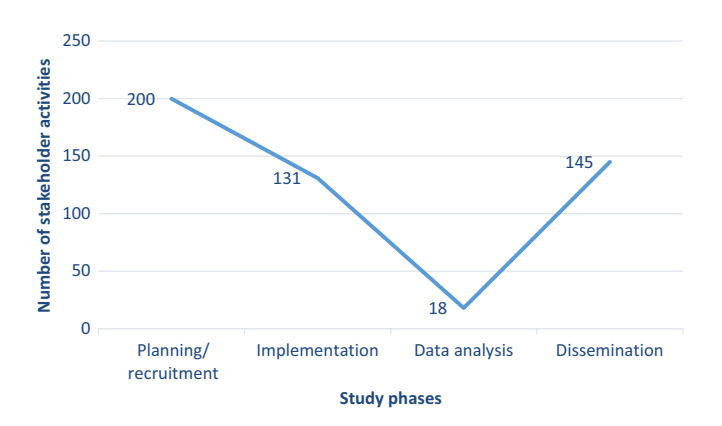
Fig. 2. Tracking stakeholder engagement across study phases.