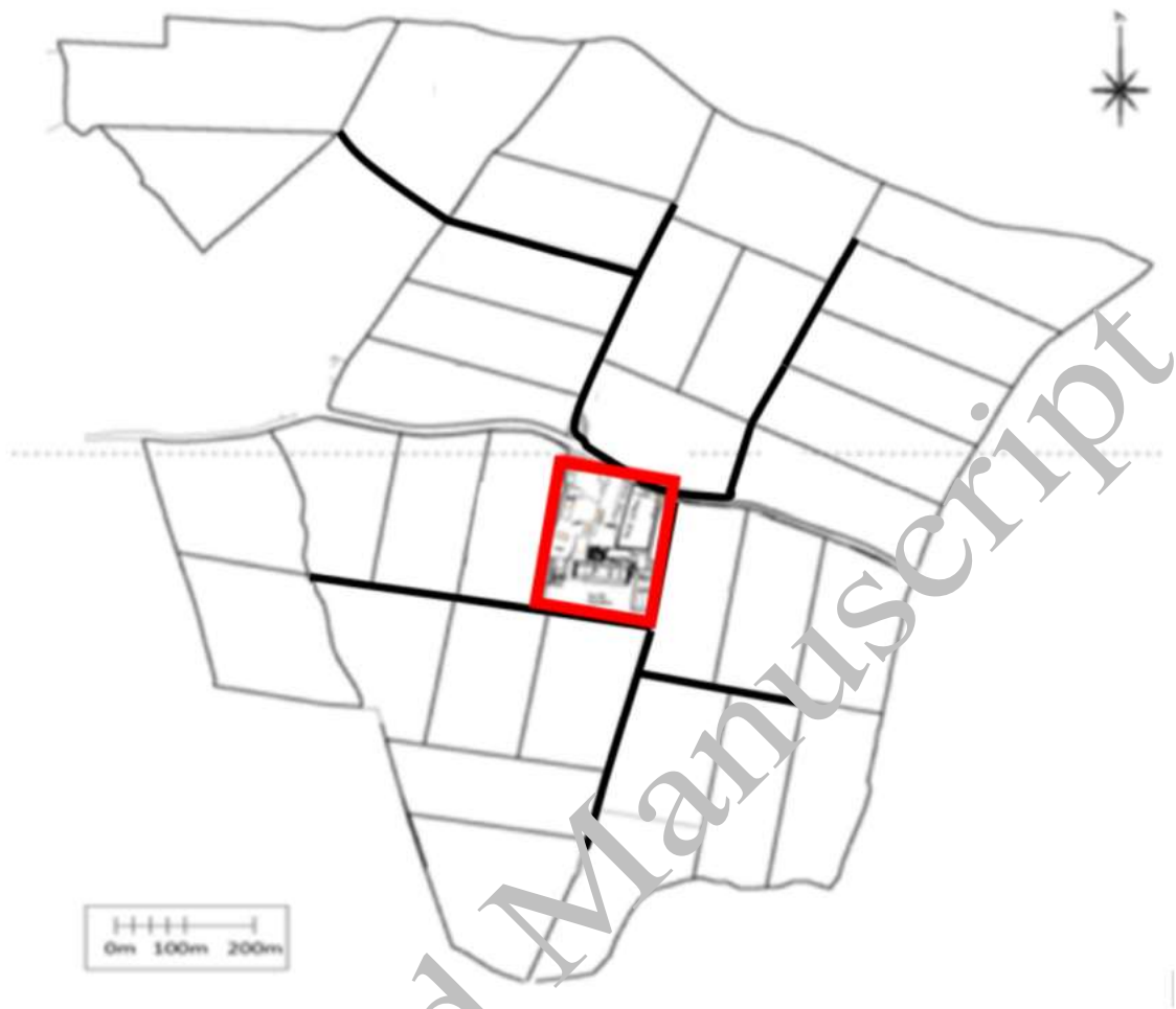
Figure 1. A layout of a pasture based dairy farm. An integrated farm roadway network and the farmyard location within the grazing platform. Red box: farmyard location. Figure sourced from Maher et al. (2023a).