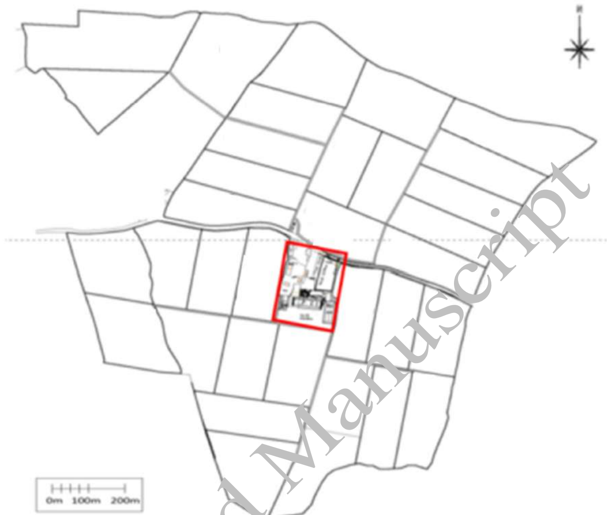
Figure 2. Farm maps displaying the farmyard location and new paddocks accessed within the grazing platform for Farm C and D. Red box: farmyard location within the grazing platform. Yellow box: new paddocks added to grazing platform. (Open source)