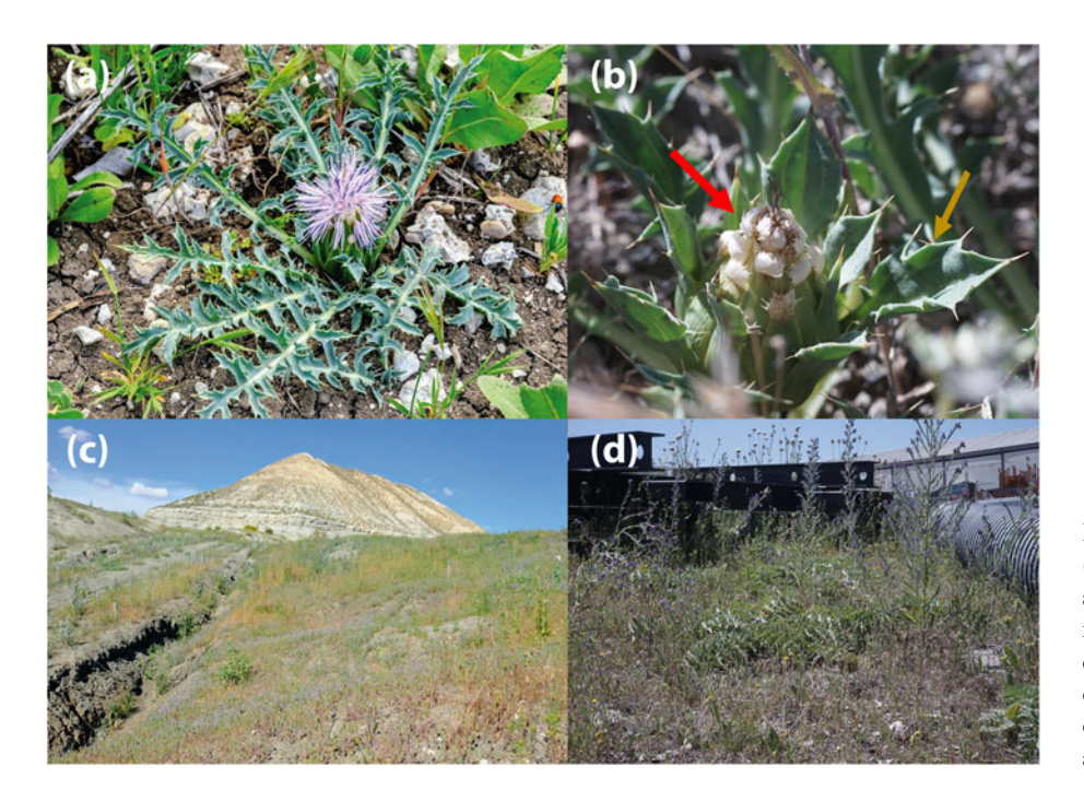
PLATE 1 Carduncellus matritensis: (a) plant, (b) detail of bracts: left arrow, cucullate appendages in intermediate bracts; right arrow, external bracts, (c) habitat in Cerro de Magán, (d) habitat in Villaluenga de la Sagra.

Sagra region, Toledo; Fig. 1; Domínguez Díaz et al., 1997), which experiences a mean annual rainfall of 300-400 mm (Chazarra et al., 2011). Its few known populations are found in deep, fertile soils in topographically depressed terrain, at the base of hills or in dry meadows of therophytes with specialized hemicryptophytes such as Cynara tournefortii Boiss. & Reut. and Klasea flavescens (L.) Holub (Luengo et al., 2017). We classify these soils as vertisols based on their physical characteristics: high expansiveness when wet, with an increase in volume > 10%, and in the dry season the appearance of wide shrinkage cracks that cause strong vertical mixing of the edaphic profiles, rapid desiccation in profile depth and root breakage. Within the potential distribution area of the species (787 km<sup>2</sup>; Fig. 1) almost all of the non-urban land with this soil type is cultivated, with such cultivation being incompatible with the presence of the species. Other associated taxa, such as C. tournefortii, are also threatened by this intensive agriculture.