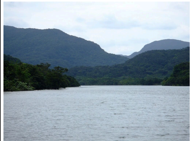
Urauchi River, Iriomote.

When his stiff body relaxed, little by little, in response to the tenderness of her breasts, a certain odd sentiment slowly spread within his body. It perhaps resembled the cool sensation poured from the skin of transparent water, the icy air felt in the first bodily contact with this world, or the tension experienced when being thrown into the endless sky. It was, as the story went, like the pain that permeated into one's entrails when torn apart by an object of desire.