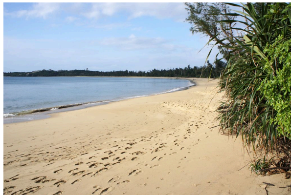
Tudumari-no-hama (Tsukigahama Beach).