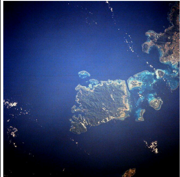
Iriomote Island from Space, 2005.