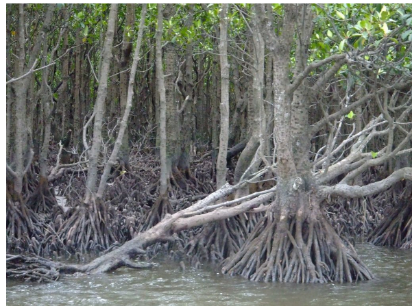
Mangroves on the Nakama River, Iriomote.

Shrugging his shoulders, Tarā stopped meddling. As his spirits dampened, to smooth things over, he reached over to the teapot and poured more tea into the cup he had just refilled so that it nearly overflowed.