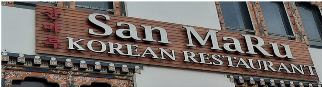
Figure 6. Bilingual English–Korean shop sign.