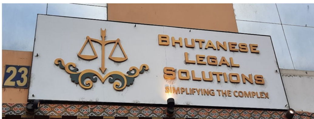
Figure 3. Monolingual English shop sign.