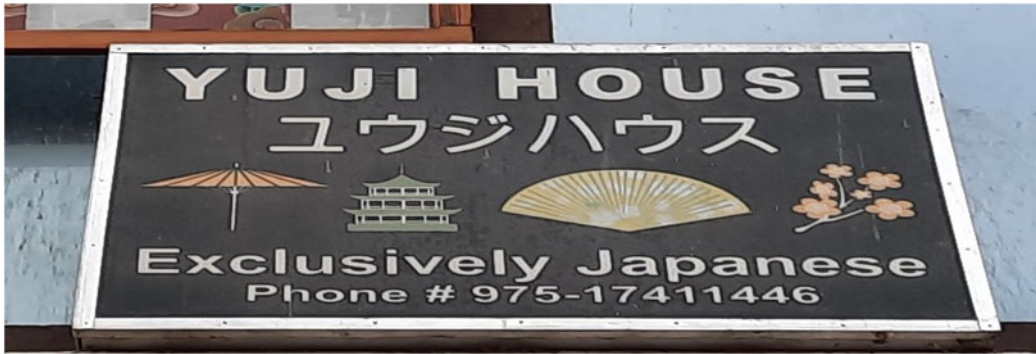
Figure 5. Bilingual English–Japanese shop sign.