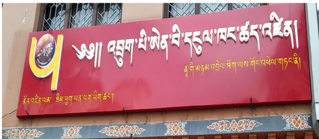
Figure 2. Monolingual Dzongkha shop sign.