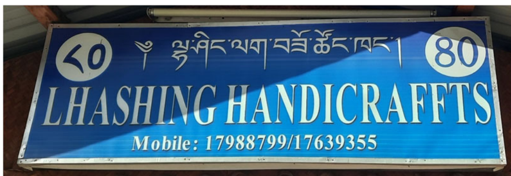
Figure 4. Bilingual English–Dzongkha shop sign.

On the other hand, a single shop name sign was written in an English–Korean combination (see Figure 6) and an English–Japanese combination (see Figure 5) was also found in the Nordzin Lam. These findings indicate that bilingual English–Dzongkha is the preferred language choice. This may be due to the government policy on the mandatory use of English–Dzongkha combination shop name signs.