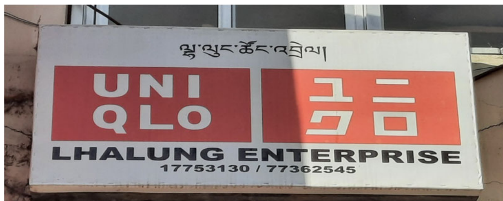
Figure 7. Trilingual Shop Sign of Dzongkha-English-Japanese.

multilingual shop names. However, as per the data collected, there is an uneven font size in the Dzongkha script making it difficult to comprehend shop owners' preferences in the language use. On the other hand, the smaller font size presented in English and other languages indicates supplementary information.