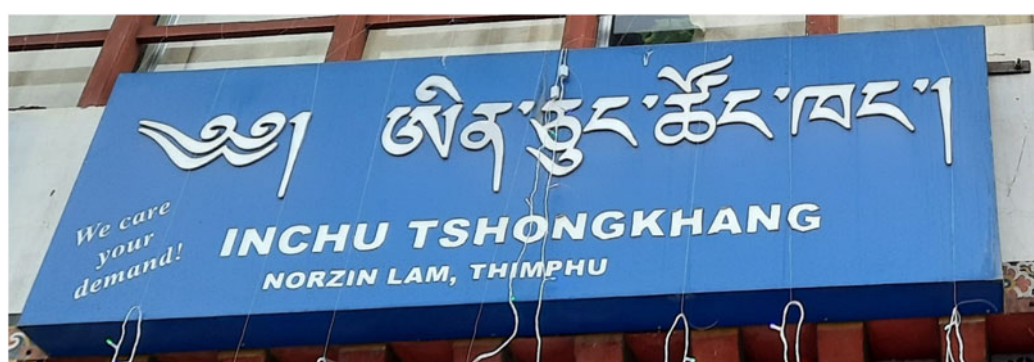
Figure 8. Larger Dzongkha font size over English.

This study set out with the aim to examine the LL of Nordzin Lam in Thimphu particularly paying a closer attention to languages used on the shop name signs. The most important finding is that English is de rigueur on all the shop names irrespective of monolingual, bilingual, or multilingual shop signs. This result is contrary to the signage guidelines (TT 2017) and the national policy and strategy of Dzongkha development (RGoB 2012), which state that shop signs should be written in Dzongkha and English. In addition, Dzongkha has a high presence in the bilingual signs, but English is the preferred language of the shop names. In terms of code preference, shop owners prefer Dzongkha on top of the other languages and are placed in a vertical position. These findings are in accord with the signage guideline, in which Dzongkha is the mandatory language on the signboards where Dzongkha script should be bigger or equal to English script and should be placed above English.