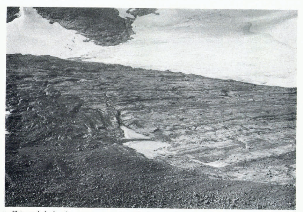
Fig. 2. Flutes on bedrock and on an over-run moraine. The flutes are relatively low and flat on the bedrock, while they are of ordinary dimensions on the moraine. (Photograph by W. Karlén, 25 August 1977.)