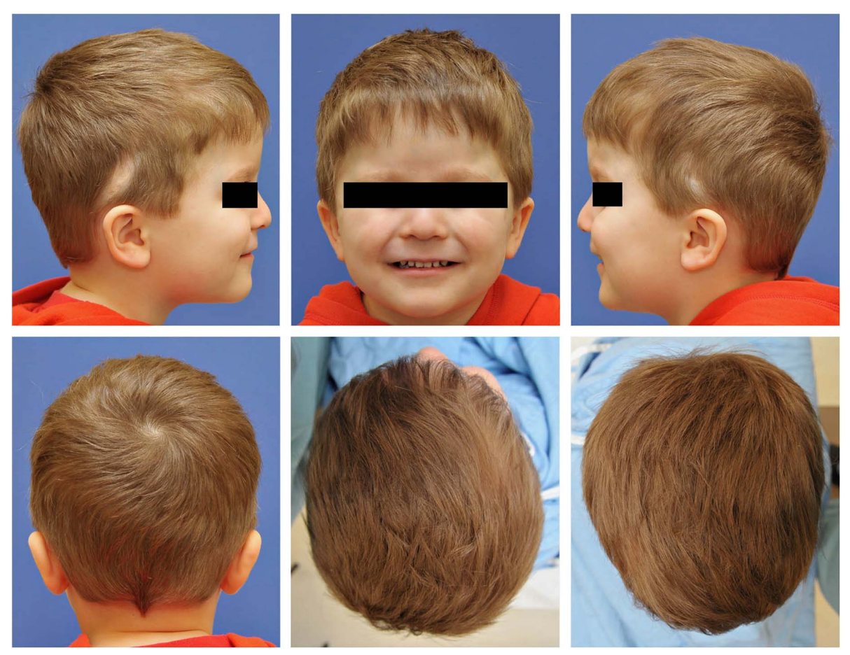
Figure 3: Photograph of the 3-year-old patient at 2-year follow-up after secondary synostosis repair.