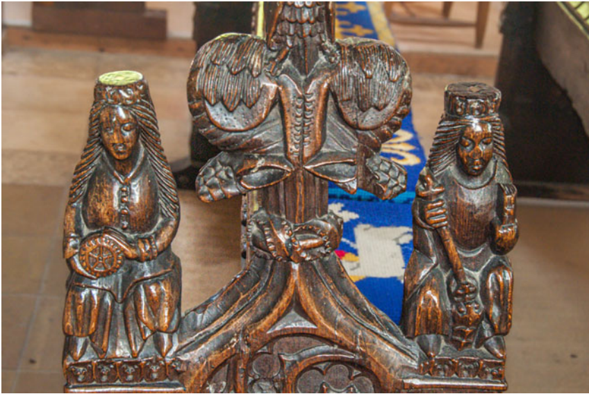
Figure 1. Church pew with bench ends depicting St Margaret and St Katherine, fifteenth century, Ufford, Suffolk, St Mary of the Assumption Church.

Church of St Helen, Norfolk, was created with a concern for safe and successful childbirth and child rearing. 27 It depicts St Margaret of Antioch alongside the three Marys (the Virgin and her sisters Mary Salomé and Mary Cleophas), each holding their children. Along with the powerful intercessor for childbirth, the three Marys represent positive and comforting images of Christian maternity in which the laywomen of the parish could locate their childbearing experience. Iconography and images reflected and cemented hierarchal relations, segregation, and communal identity. 28 Moreover, local wives were charged with much of the maintenance and cleaning of the church nave. 29 Therefore, they had the most direct interaction and familiarity with these holy images and appreciated the significance of specific spaces within the church. It seems plausible that there were pockets of space in the parish church in which women could find imagery that simultaneously reflected their experience, assured them of saintly protection, and celebrated their parturientcy.