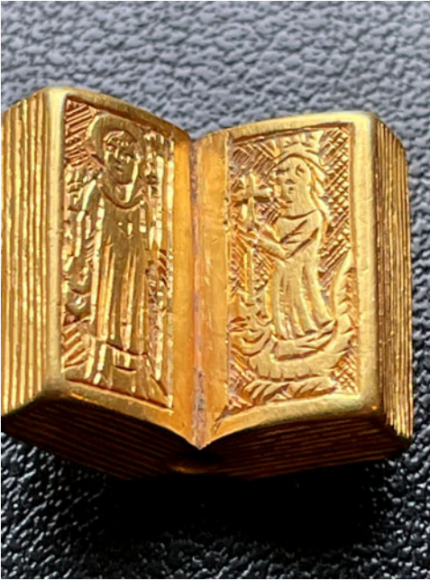
Figure 3. Gold bead depicting St Leonard and St Margaret, fifteenth century, found in Yorkshire, England, in November 2021.