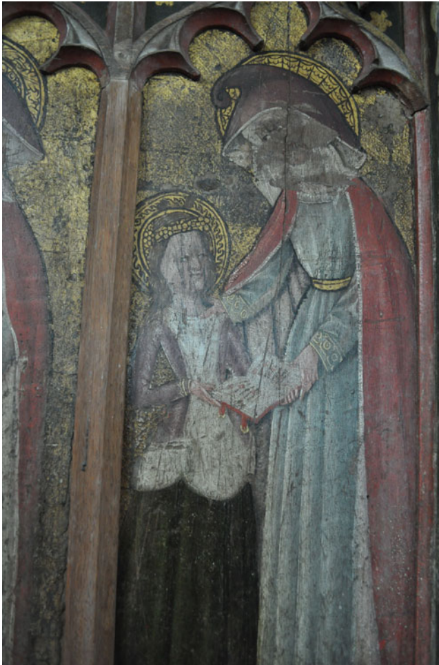
Figure 2. Section of the Houghton St Giles rood screen depicting Elizabeth and John and St Anne teaching the Virgin how to read, fifteenth century, St Giles, Houghton St Giles, Norfolk.

of midwives), and St Scholastica (associated with the education of children). Another Norfolk screen in Houghton St Giles depicts the three Marys and their children, Elizabeth with her son John the Baptist, Emeria, the mother of Elizabeth and the sister of St Anne, and St Anne teaching a young Virgin Mary how to read (Figure 2). 30 These images of the Holy Kinship were central to late medieval Christian concepts of femininity, but they also stressed the