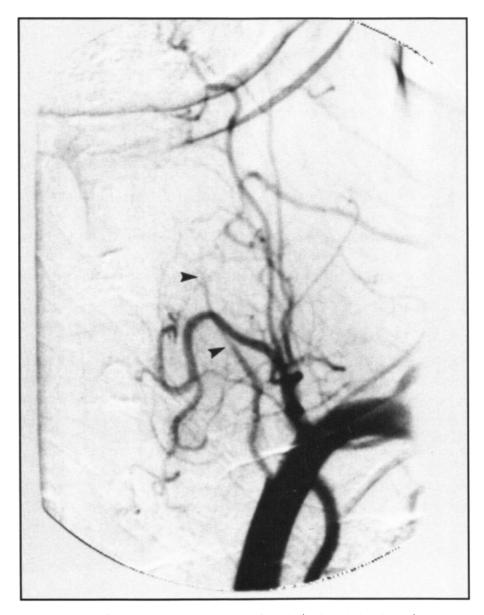
Figure 2 — Cerebral angiogram. Left subclavian injection showing a tapering stenosis (lower arrowhead), and occlusion (upper arrowhead) of the proximal left vertebral artery.

Four-vessel cerebral angiography was performed 13 days after stroke onset. The extracranial carotid arteries and the intracranial circulation were normal. Both posterior cerebral arteries filled from the carotid system. The left vertebral artery tapered to an occlusion in the foramen transversarium at the level of C6 (Figure 2). There was collateral flow to the distal left vertebral artery via branches of the left occipital artery. The right vertebral artery was irregularly stenosed throughout much of its course in the foramen transversarium (Figure 3). The distal right vertebral artery and the basilar artery appeared normal. The angiographic appearances were considered indicative of bilateral vertebral artery dissection.