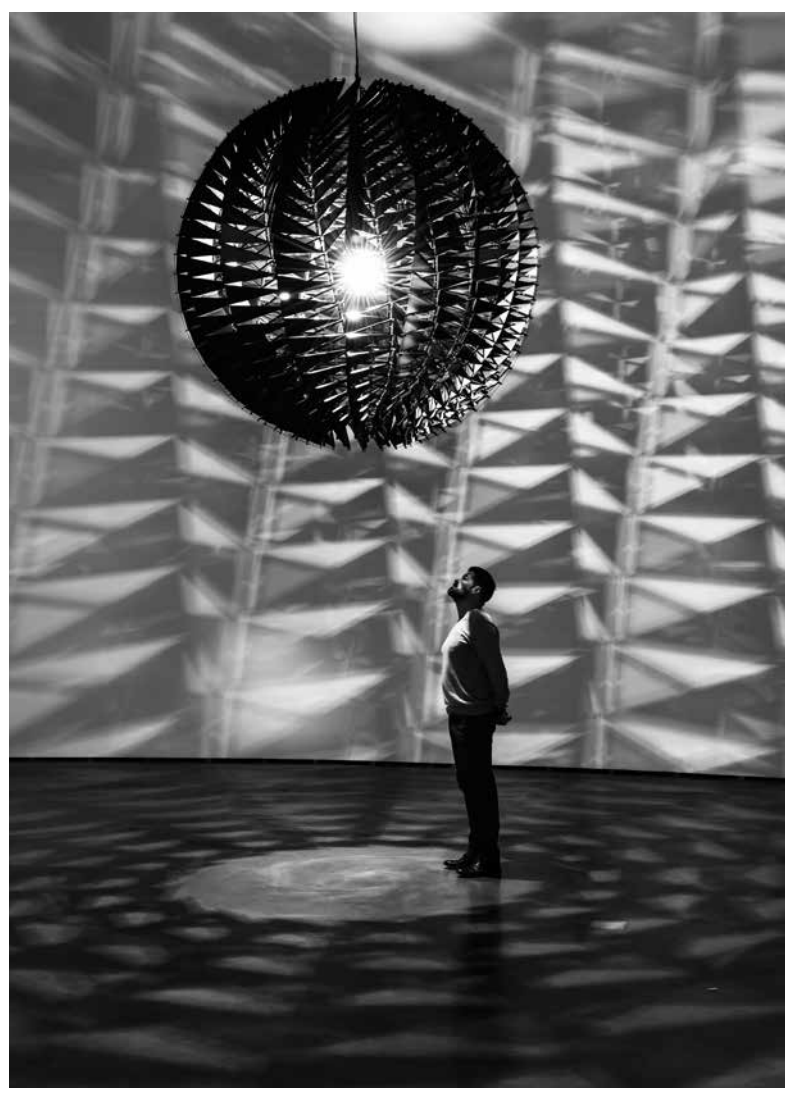
Olafur Eliasson, In Real Life, 2019. Aluminum, colour-effect filter glass (green, yellow, orange, red, pink, cyan), bulb, LED light. Diameter 208 cm. Installation view: Guggenheim Museum Bilbao, 2020, where the exhibition was restaged after its run at Tate Modern.

'[...] as my eyes grew accustomed to the light, details of the room within emerged slowly from the mist, strange animals, statues, and gold everywhere the glint of gold." (Howard Carter)