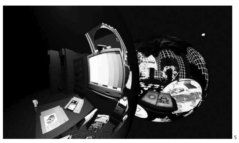
3-5 Space Popular, 'Freestyle - Architectural Adventures in Mass Media'.