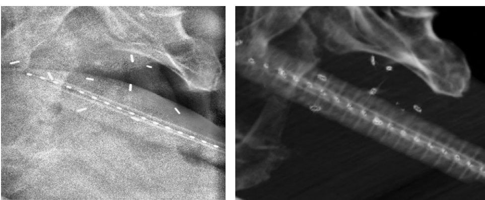
Figure 2. Radiographic image obtained from X-ray imaging system in the first column and digitally reconstructed radiograph in the second column by the ExacTrac system from the CT images.

1 missed fraction in the third week of treatment and a 6-day treatment interruption between fractions 20 and 21. She then began a protracted treatment interruption lasting 33 days during which she was removed from study participation, and an additional 23·4 Gy were prescribed to the residual primary area at 1·8 Gy per day using a four-field technique and three-dimensional planning (71 Gy total, a slightly increased dose to compensate somewhat for her treatment delay). She took an additional treatment break between fractions 29 and 30 for 3 and half weeks, finally completing 71 Gy to the primary in 41 fractions over 123 days.