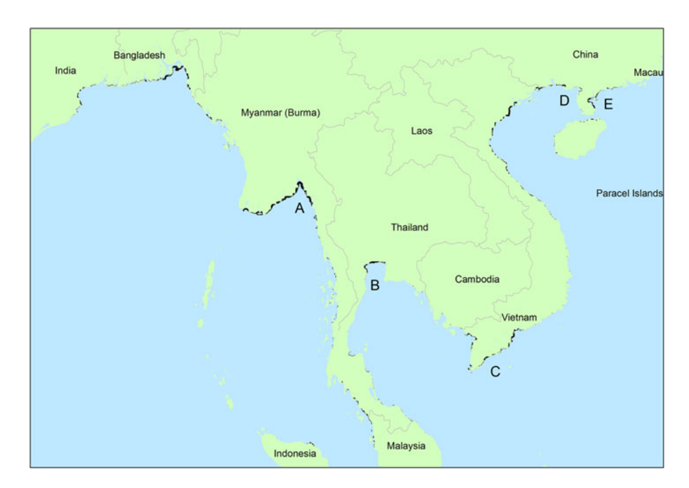
Figure 2. Modelled potential distribution of Spoon-billed Sandpiper habitat. Map shows the 5% of the study area with the highest predicted likelihood of occupancy. The predicted distribution of the Spoon-billed Sandpiper on which Figure 2 is based is available as a .tif for GIS in Figure S2. A indicates Gulf of Mottama, Myanmar, B is Inner Gulf of Thailand, C is south Mekong delta, D is Guangxi and E indicates Guangdong.

The species is widely distributed in winter over an area stretching from Bangladesh to Eastern China just south of the Yangtze River estuary. The majority of birds seem to winter in Myanmar, where 60% of the population has been observed. At least 80% of the entire global population appears to winter in Myanmar and Bangladesh. Surveys of wintering Spoon-billed Sandpipers were undertaken at sites in six of the flyway countries over a nine-year period. Collating records of these birds allows us to build up a database of areas used by wintering individuals, pointing to areas of conservation priority for the species. Difficulties in standardisation of