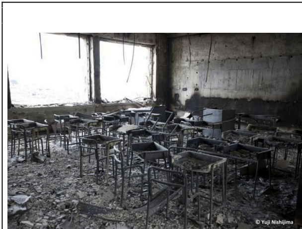
Minamihama School.

experienced by the community, which did not just encompass material loss, but also the loss of innocence and the future. This is shown in these images of a primary school which had been not only affected by the earthquake and tsunami but which had also then been gutted by fire. A set of photographs by Nishijima Yūji demonstrates this. While his photographs frame the destruction from a child's point of view, his commentary on the photograph makes intertextual references to other disasters.