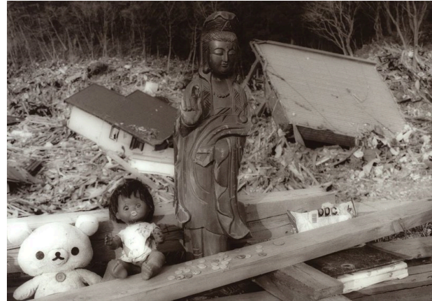
Fallen Kannon statue. Nagasaki temple destroyed