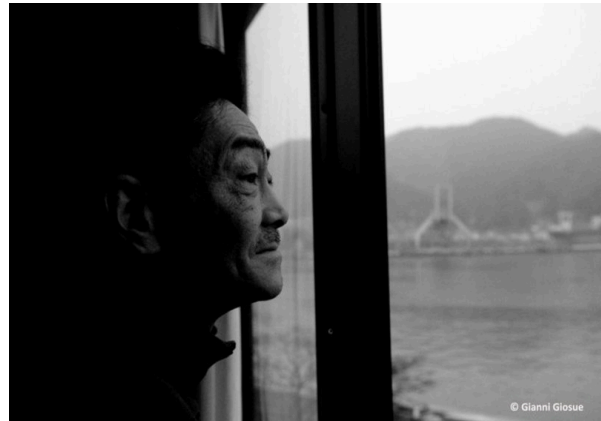
Elderly Survivor, photograph by Gianni Giosue.

friends. The concentration of representations of elderly residents in the exhibition is not surprising as a disproportionate number of Northeastern Japan's population is elderly. Approximately one third of the affected residents were over 65, which is higher than the national average of 23%. 18