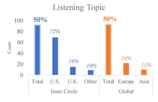
Figure 1. Topics in listening materials by region (N = 180)

The Specifications (2016) designates 'original English-language materials' (p. 1) as the sources, which could partly explain the dominant percentage of Inner Circle topics. In fact, most sources of the reading texts could be traced to Inner Circle newspapers, magazines, and websites (see Figure 3), with the top sources being NPR News, Interesting Engineering, BBC, The Guardian, and The New York Times. Of course, some of the sources target a more global audience (e.g.