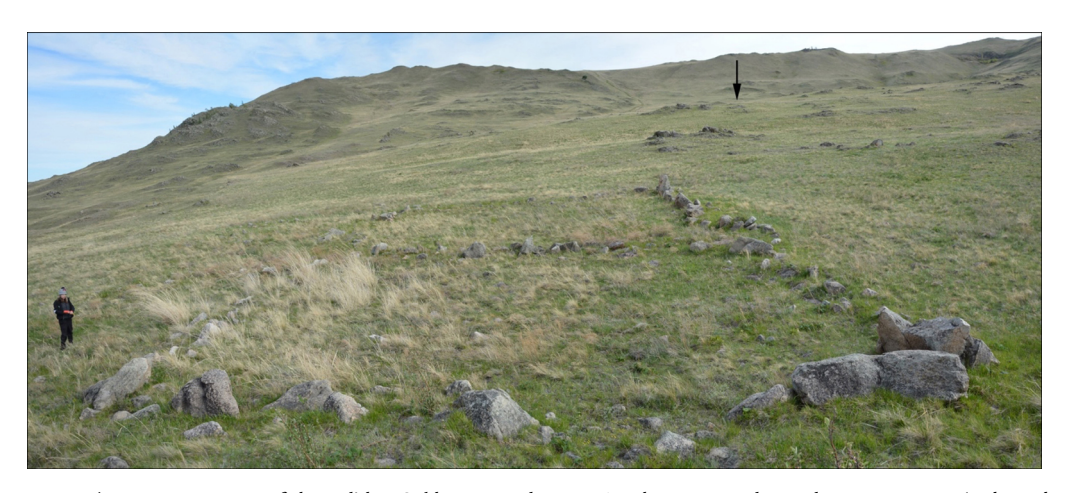
Figure 4. Panoramic view of the Bol'shoy Sakhsar II settlement. Another very similar settlement structure (indicated with arrow) is just visible to the south of the site.

Wider scale research, using the characteristics of known sites and their environments—identified on the ground—as the basis for automated searches of multi-spectral satellite imagery is now underway, alongside more traditional visual inspection. In both cases, it is hoped that a better understanding of the location of these sites will help us to comprehend their significance within local patterns of landscape use.