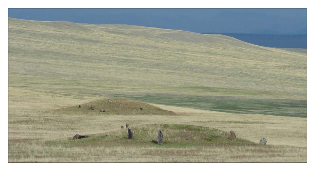
Figure 1. A small group of Early Iron Age Burial mounds near Orositelnyy, Khakassia.