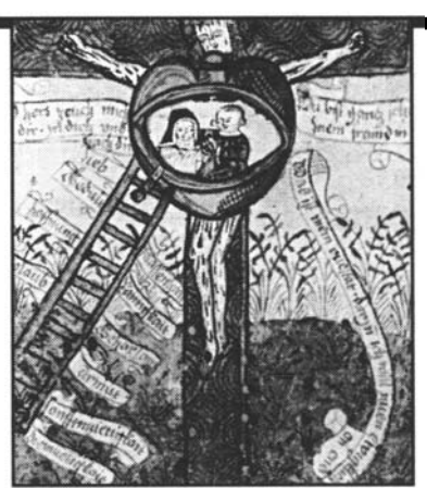
From Nuns as Artists

Los Angeles An Ahmanson Murphy Fine Arts Book, $55.00 cloth,