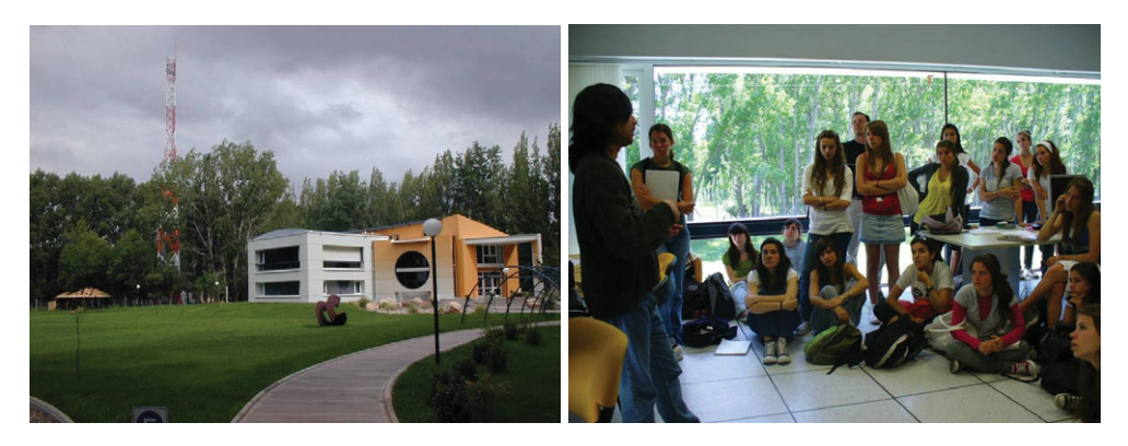
Figure 2. ( Left ) Headquarters of the Pierre Auger Observatory in Malargüe. ( Right ) Meeting with high school students at the computer center.

An specially conceived Visitor Center was included in the design of the Pierre Auger campus in the city of Malargüe, Mendoza, Argentina. One of its main objectives is the contact with the local community, through educational courses, talks, conferences and workshops for different levels. Fig. 2 (left) shows the Office building, were the Visitor Center is. Around 7,000 visitors per year, since 2005, assist to the free dayly talks. In Figs. 2 (right) and 3, different groups are visiting the installations.