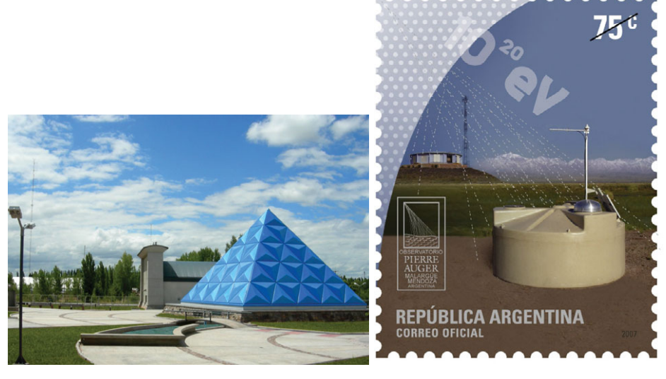
Figure 4. (Left) Planetarium Malargüe. (Right) Post Office stamp, issued in 2006.