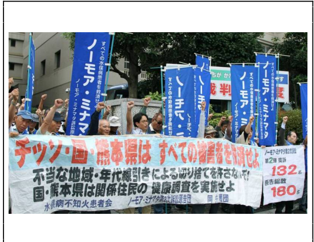
192 Minamata victims sue for recognition (2013)

elected to the Minamata city assembly. He was and is still the only city assembly member who was also a Minamata poisoning victim. Minamata patients are still stigmatized in the city. Through a series of confrontational activities, he aimed to change the "feudalcastle-town" mentality of the city. In that sense, he was oriented toward renovation. It was the death of his father and his own suffering from acute Minamata symptoms that drove him to become a dedicated renovator.