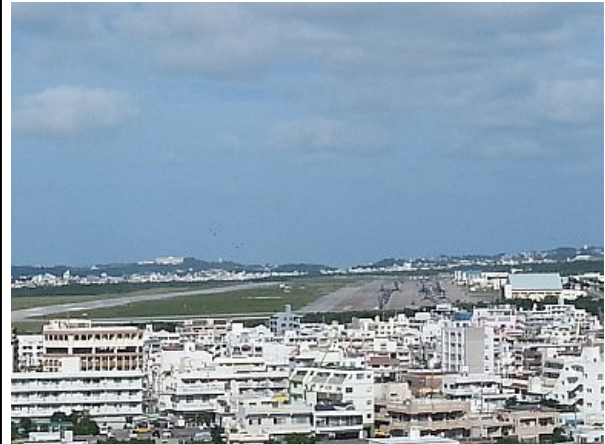
Futenma air station, surrounded by homes and businesses.

The directive states that AICUZ programs are required for bases within the US and its territories and possessions, and that they “may be developed” at bases in foreign countries. That means they are not required. But at MCAS Futenma an AICUZ program exists, though for “noise study only”. (appendix [b]) As for clear zones, the aerial photograph above shows that MCAS Futenma has adopted the perfect bureaucratic solution: the requirement to have clear zones has been met by simply designating two areas (largely off the base) as “clear zones” while doing nothing actually to clear them. This, presumably, is what shocked the not easily shockable Donald Rumsfeld. Every USMC Air Facility inside the US has clear zones entirely within the base. Futenma base isn’t large enough to do that.