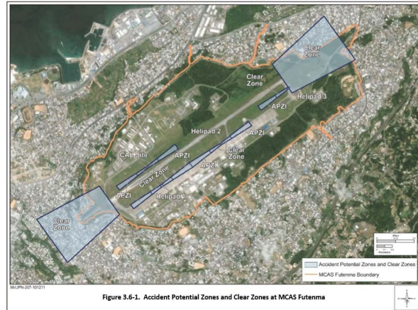
Figure 3.6-1. Accident Potential Zones and Clear Zones at MCAS Futenma

In 2003 then US Secretary of Defense Donald Rumsfeld flew over Marine Corps Air Station (MCAS) Futenma, Okinawa, looked down, and declared it to be “the most dangerous base in the world.” Of course there are many bases, including some in war zones, that could contest that honor. The question is, what did Rumsfeld see that shocked him into making this extreme statement? He saw an airstrip smack in the middle of a crowded city, with residences, parks, schools, businesses, right up to the fence.