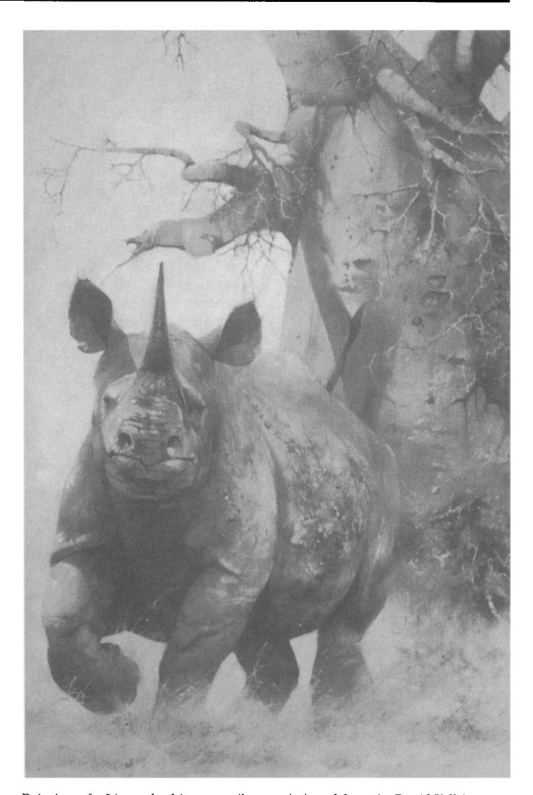
Painting of a Liwonde rhinoceros (by permission of the artist David Kelly).

Elephant populations in Borno State, Nigeria - one of only a few states in Nigeria with an elephant population - have declined from an estimated 8060 in the 1970s to 200 today. The decline is attributed to habitat fragmentation, poaching and poor problem- animal control, accompanied by lack of political will and funding. The Environmental Protection Agency for Borno is finalizing an action plan for elephant conservation and is reviewing existing environmental laws. Source: Pachyderm, No. 23, 1997.