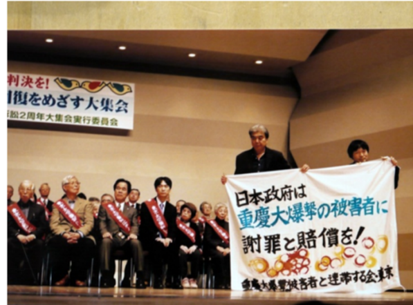
Supporters of a lawsuit demanding an apology and compensation to victims of Japan’s air raids on Chongqing, China.