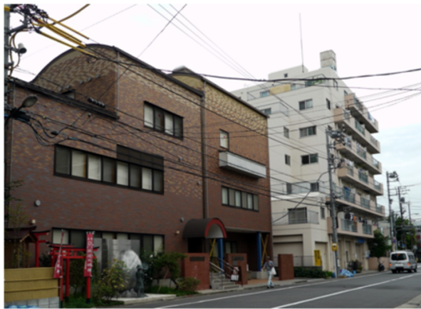
Center of the Tokyo Air Raid and War Damages, Koto Ward