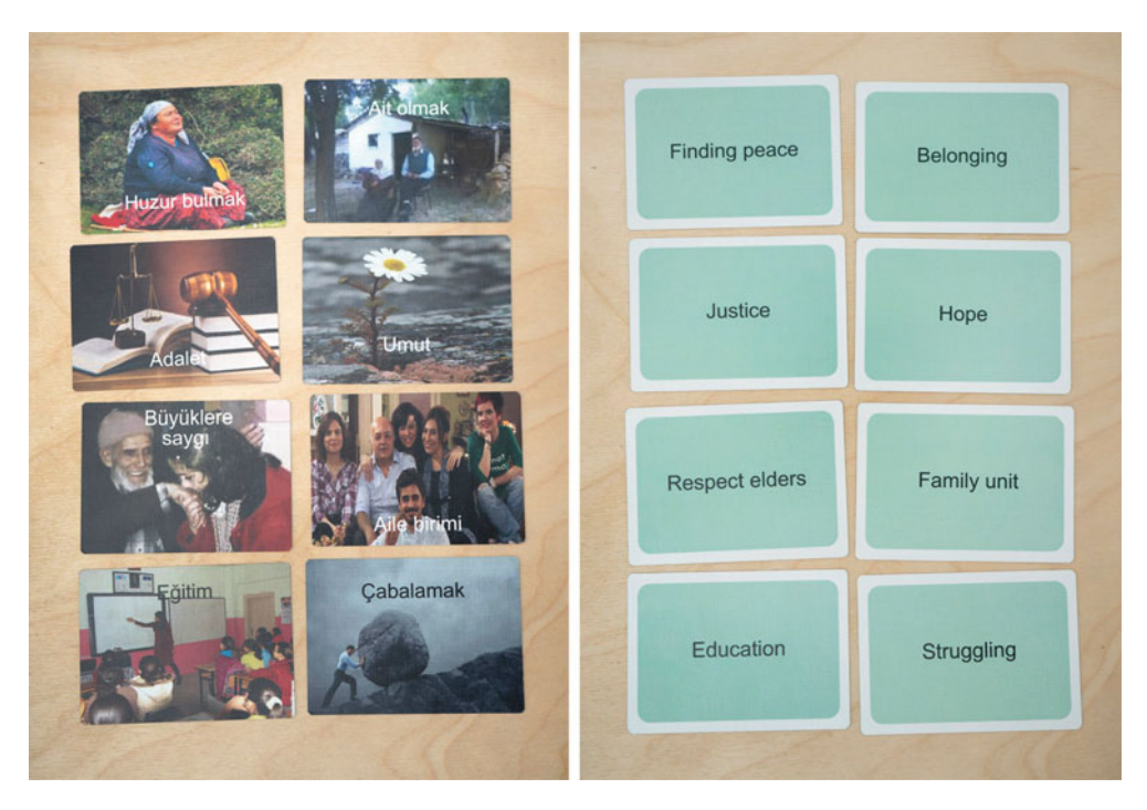
Figure 1. Turkish collectivist 'value cards'

on the bus', Chinese finger traps). The culturally adapted ACT group protocol was renamed: 'Farkındalık ve Şevkatle Kabullenme' ('Acceptance with Mindfulness and Compassion').