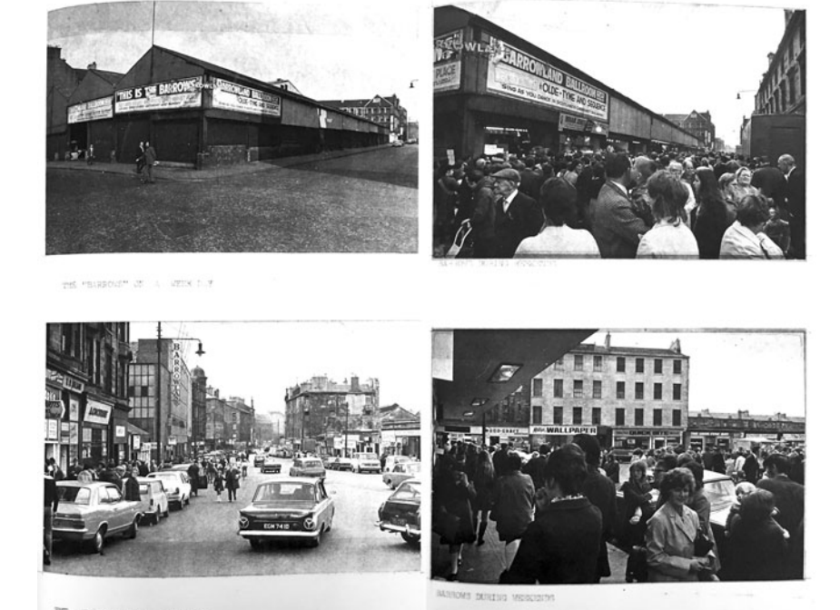
Figure 2: Clockwise from top left: "The Barrows on a weekday"; "The Barrows on a weekend"; "The Barrows on a Sunday". Mansley, Glasgow East Flank , 12–13.

sought aspects of the market that were hidden from the planners' objective gaze: the affective draw of its form and tradition, the changes in class structures that either helped or hindered the institution's longevity and the weight that individual consumers gave 'bargain' shopping vis-à-vis the potential disruption of motorway construction.